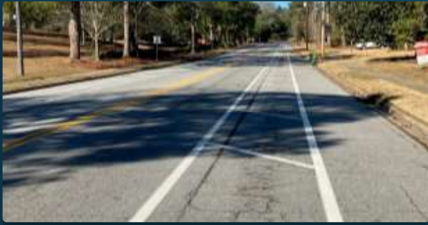
Edgewood Road Striping