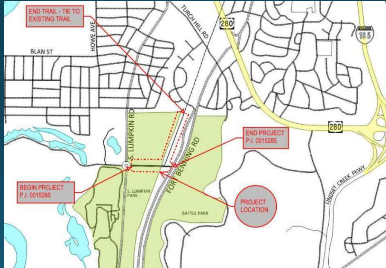
Infantry Road & Follow Me Trail Extension