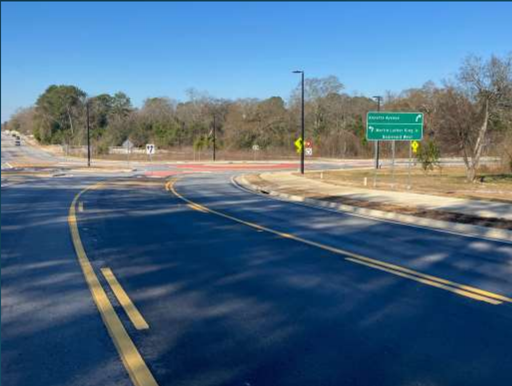
Phase I Roundabout