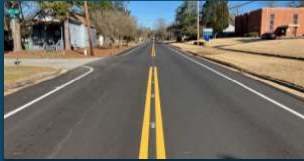
12 th Avenue Resurfacing/Striping