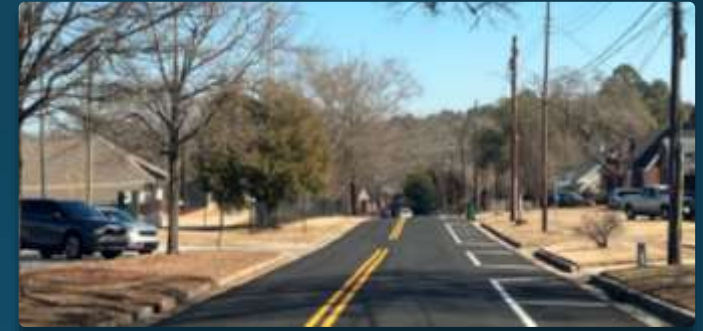
32 nd Street Resurfacing/Striping