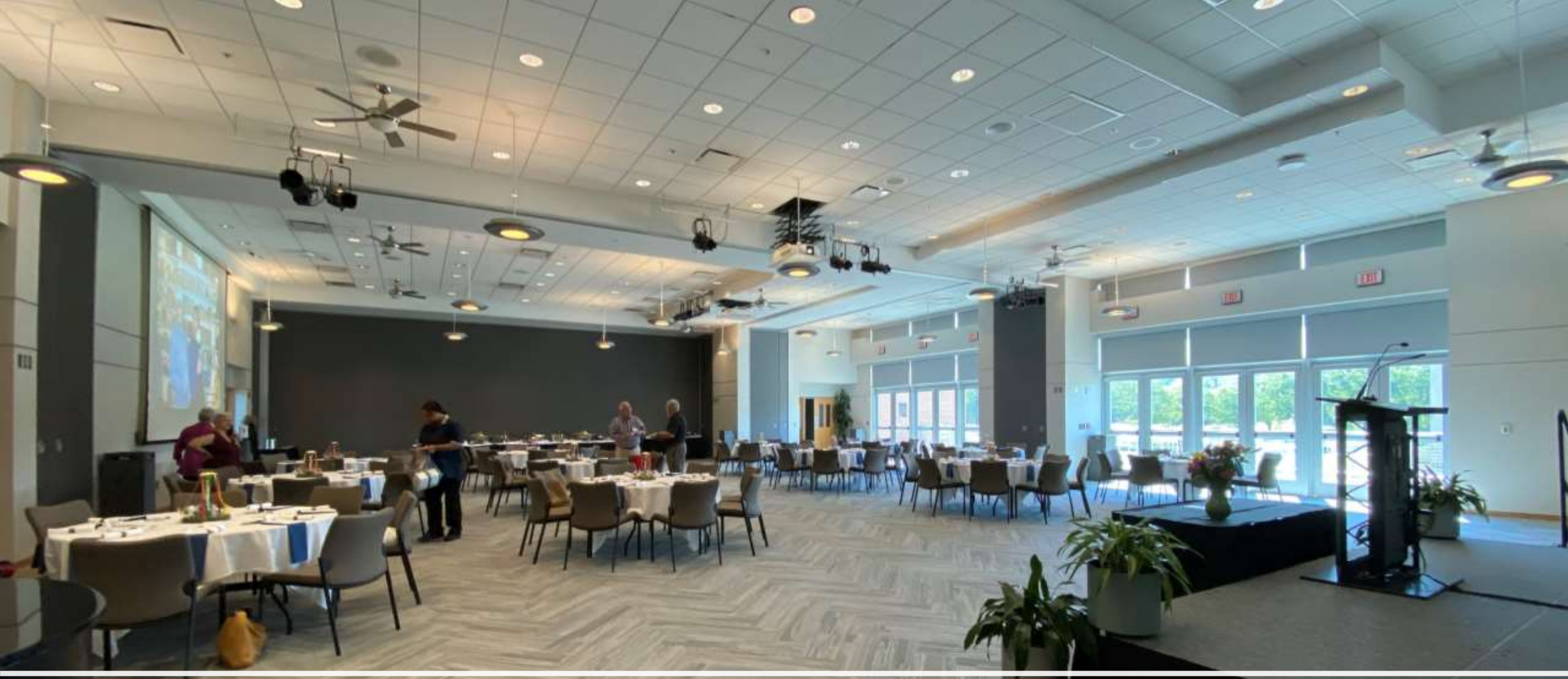
Cunningham Center, 3100 Gentian Blvd