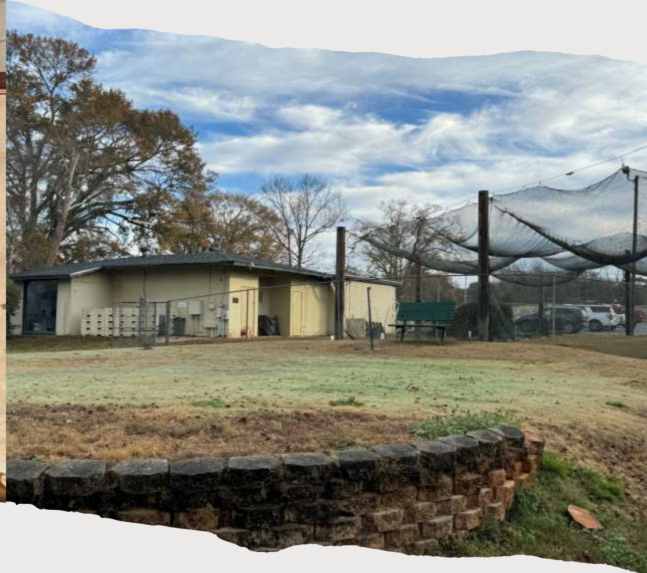
Clubhouse and Storage building