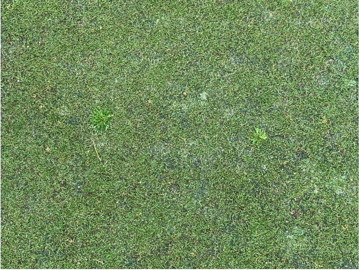
Oxbow – weeds in green