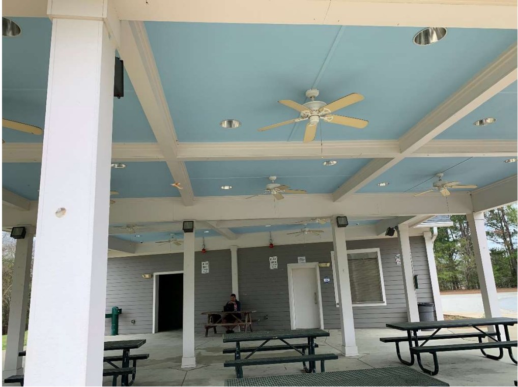
Dog Park pavilion