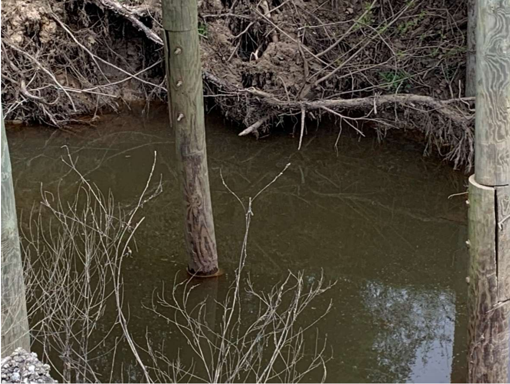
Oxbow bridge support separation