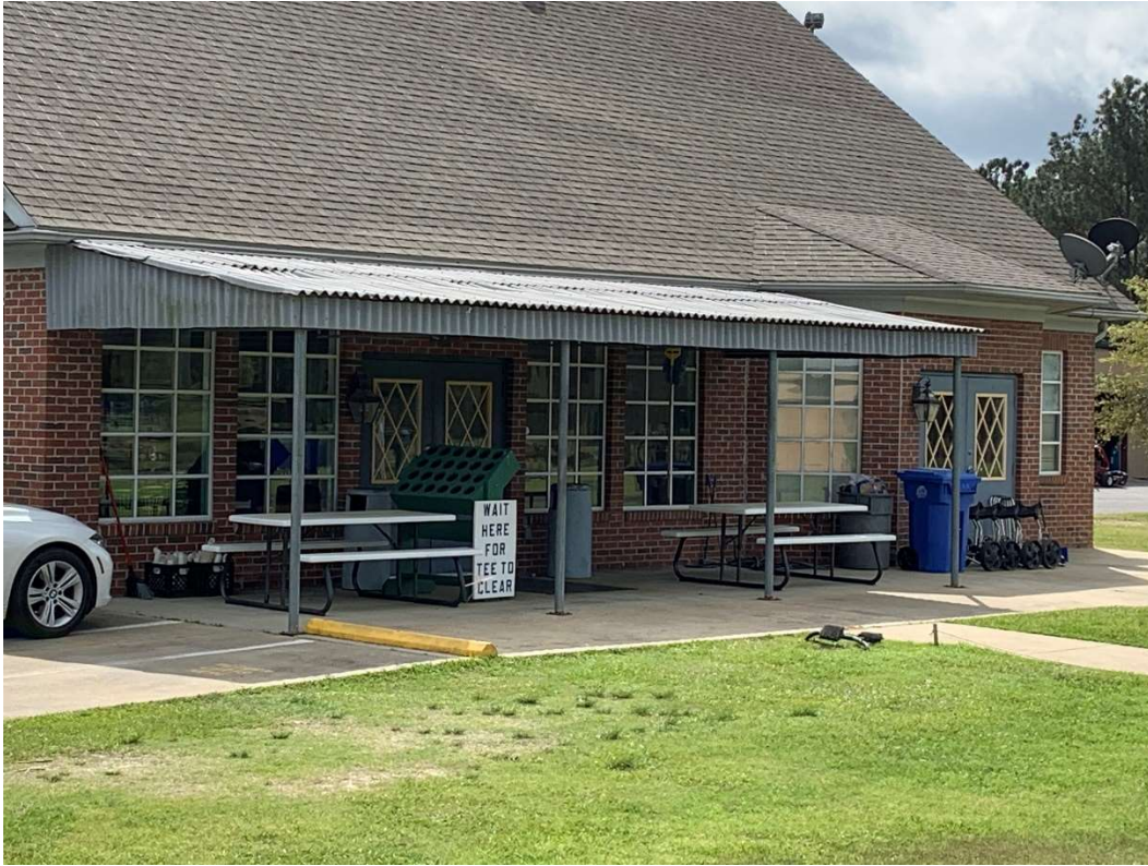
Oxbow clubhouse - aged awning