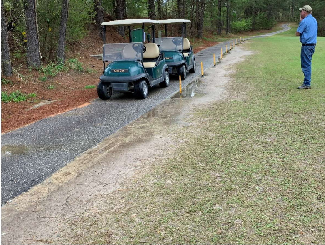
Oxbow cart path and turf damage