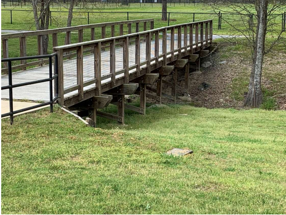
Dog Park bridge