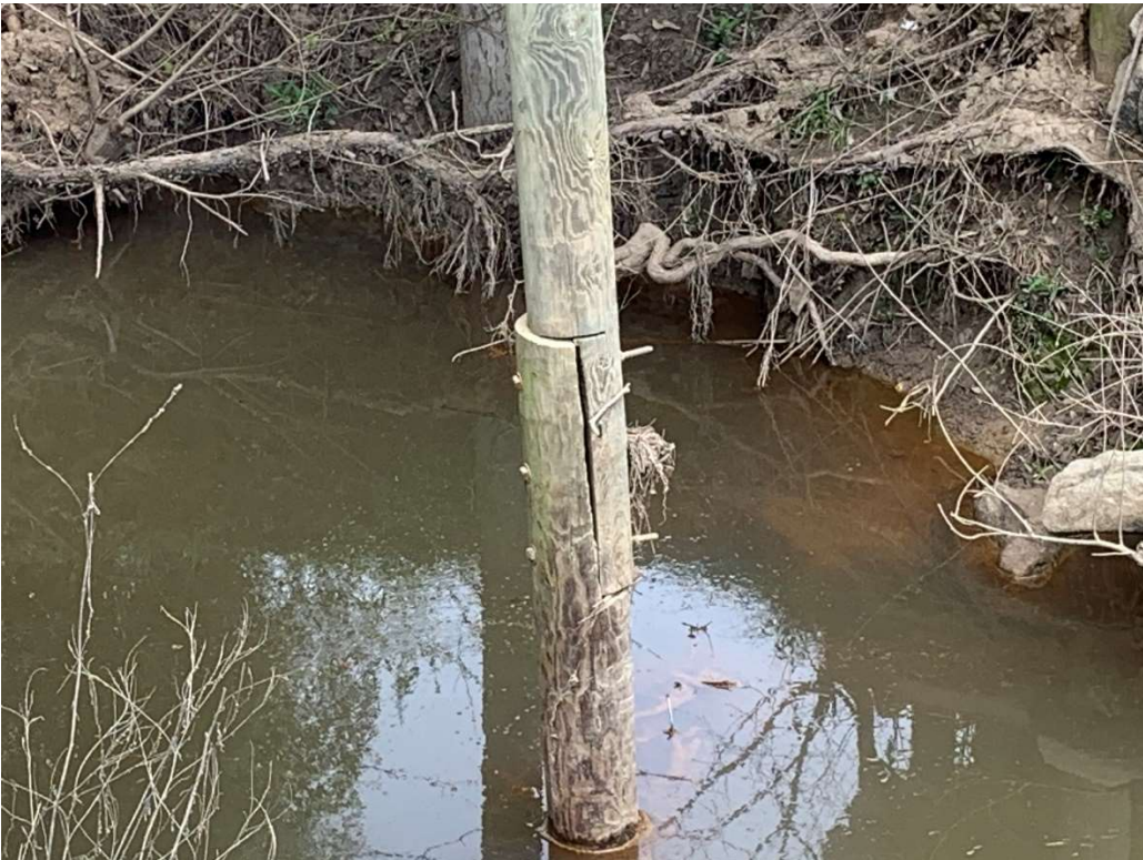
Oxbow bridge support