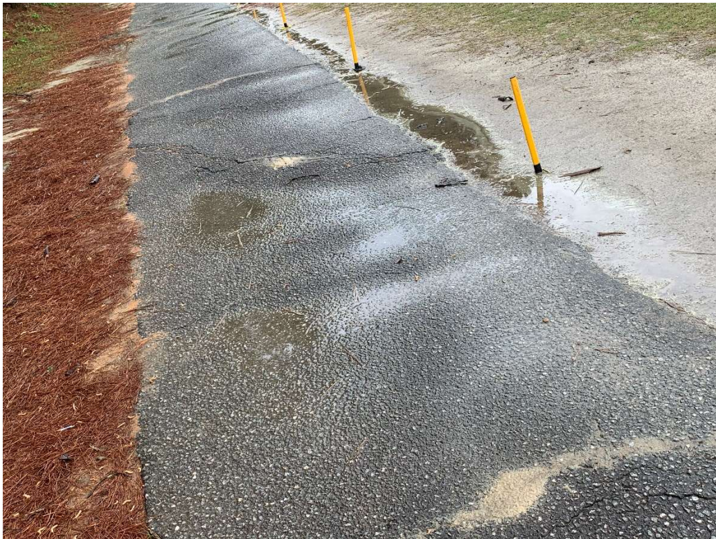
Oxbow #3 cart path damage