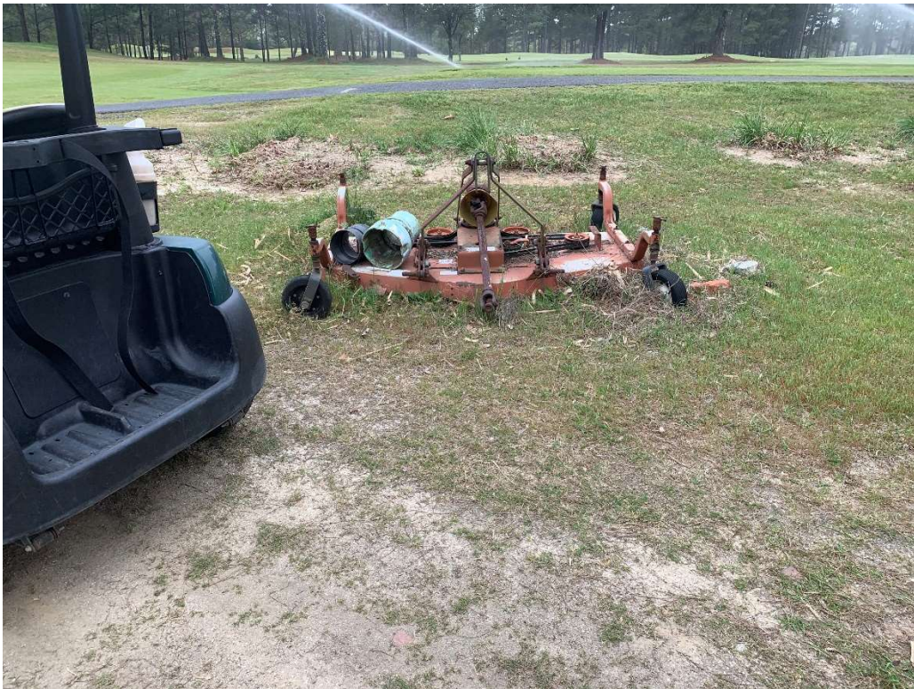
Equipment to be moved