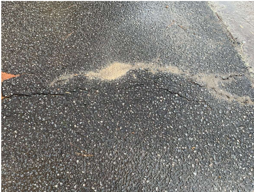
Oxbow cart path – root damage