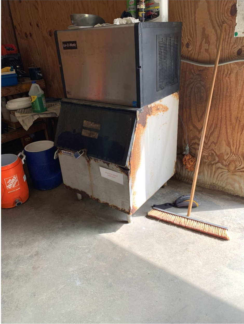
Oxbow ice maker and bin