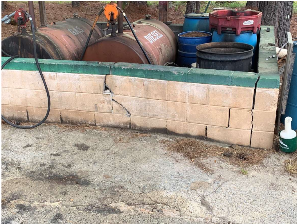
Oxbow retaining wall for fuel