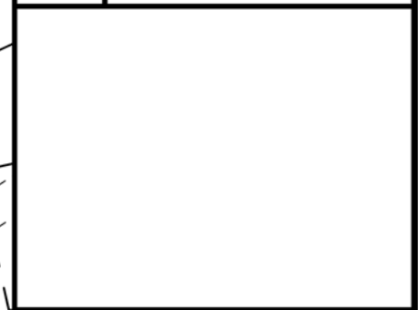
EXHIBIT 8714 CREEKRISE DRIVE LYING IN LAND LOT 277, 19TH DISTRICT MUSCOGEE COUNTY, COLUMBUS, GEORGIA Prepared for: PATEL

PROJECT NO.: 21-7999 DRAWN BY: SBM DESIGNED BY: N/A SURVEYED BY: N/A SURVEY DATE: N/A CHECKED BY: CEB SCALE: 1" = 100' DATE: 08/12/2021