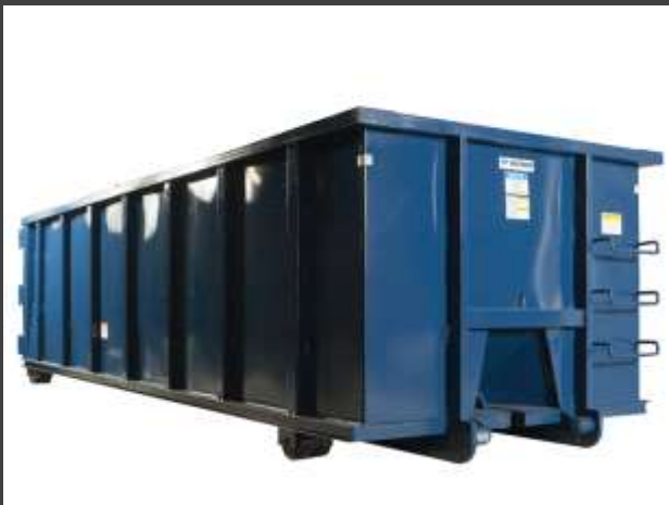
30 YARD OPEN TOP