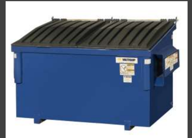
4 YARD DUMPSTER