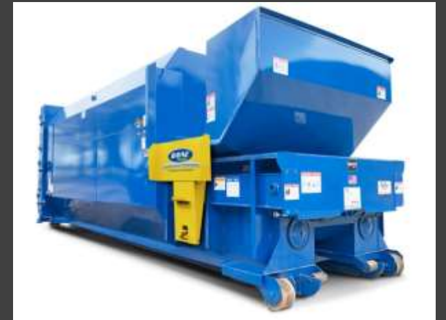
30 YARD COMPACTOR