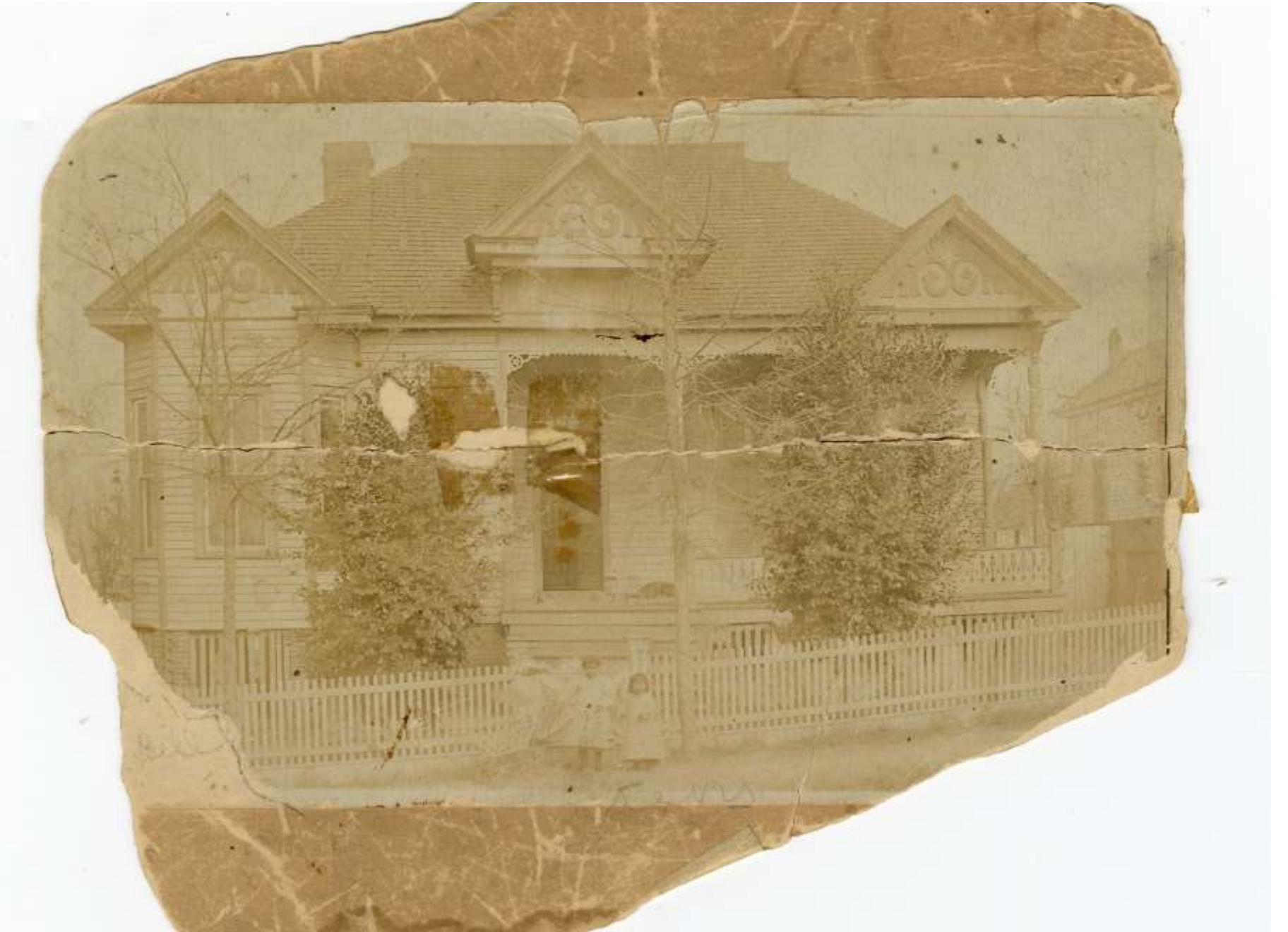
411 21st Street - Rose Hill Neighborhood