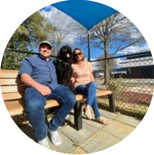
PET RELIEF STATIONS