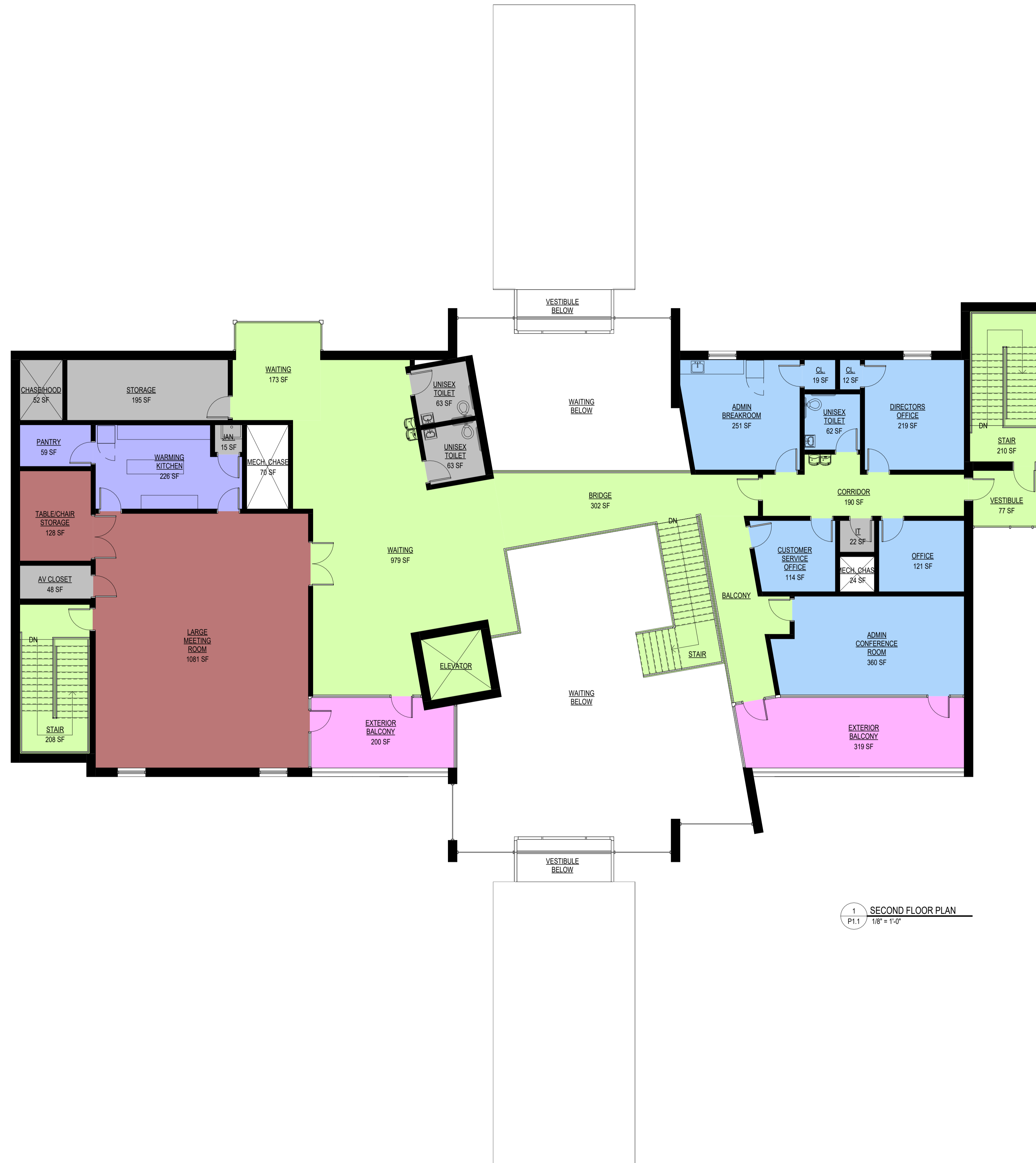
1 SECOND FLOOR PLAN P1.1 1/8" = 1'-0"