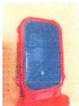
Post-treated water (Distilled or Filtered Water)