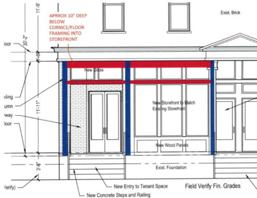
N. Dickason Street Elevation