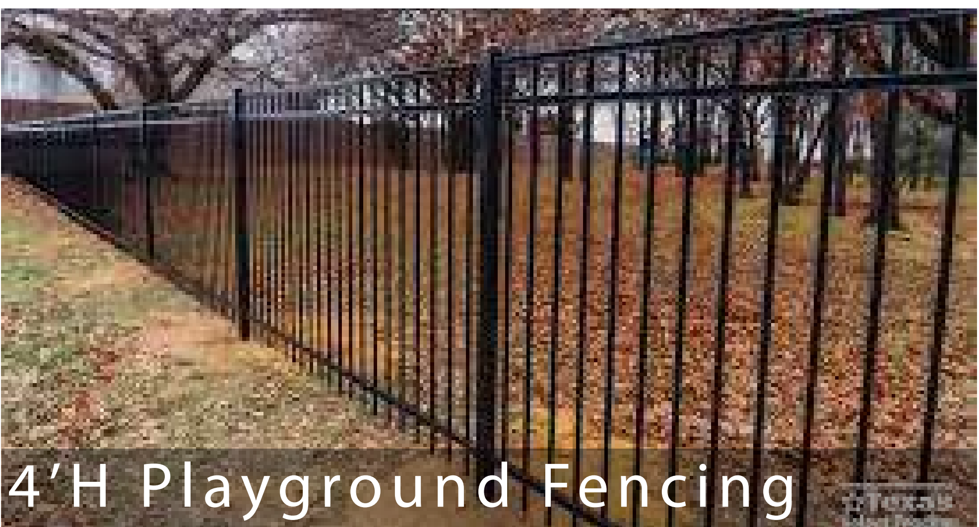
4'H Playground Fencing