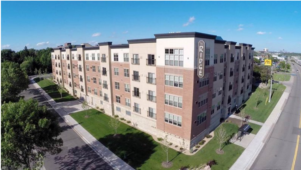
The Ridge Minnetonka