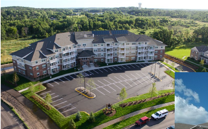
The Depot Elk River