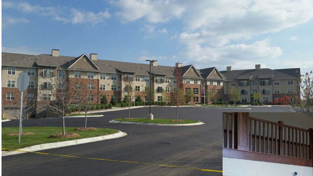
Bottineau Ridge Maple Grove