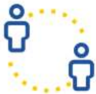
#1 Community Engagement