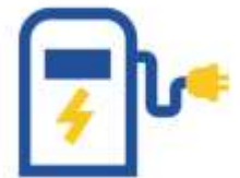
#6 EV 101 & EVs in Greater Minnesota