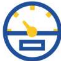
#3 Home Energy Efficiency