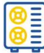
#4 Heat Pumps for Homes