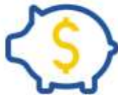
#2 Paying for Your Project