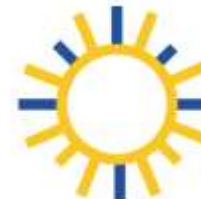
#5 How to Speak Solar