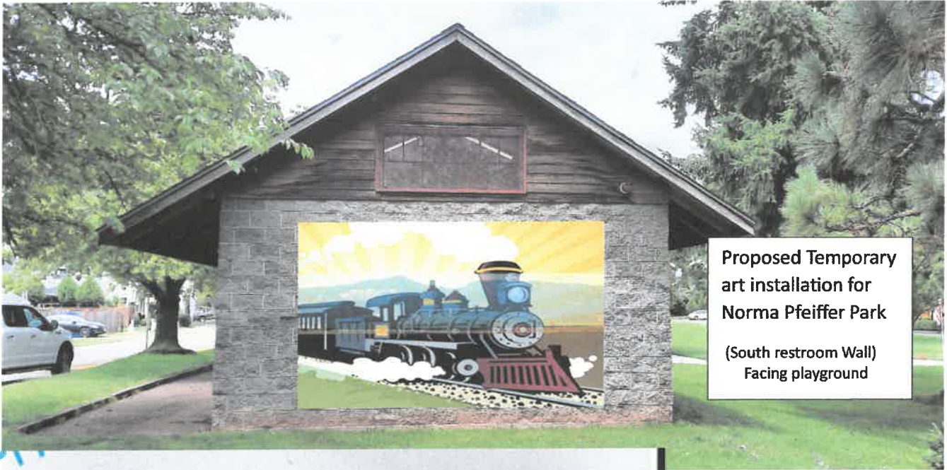
Proposed Temporary art installation for Norma Pfeiffer Park (South restroom Wall) Facing playground