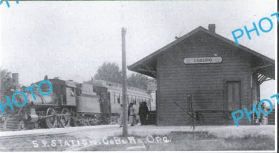
1910 Historic photo of Coburg Train and Train Depot