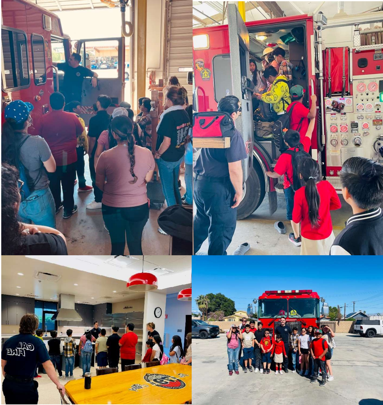
4/25/24 – Many were in attendance for the Ribbon Cutting Ceremony of Fire Station #79. (See photos below)