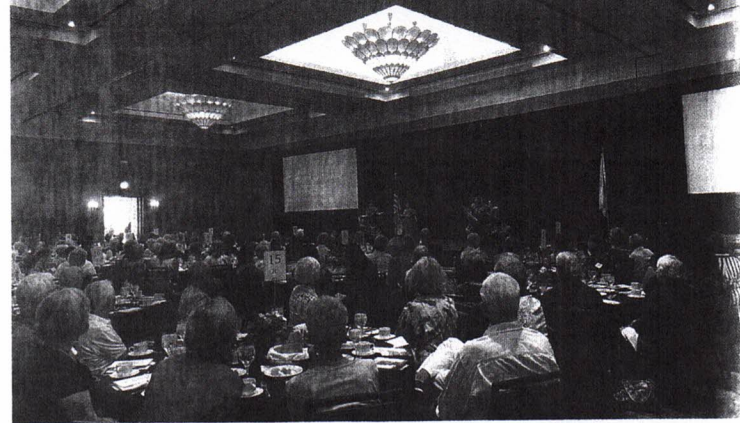
Celebrating our generous donors at our RWM Donor Luncheon.