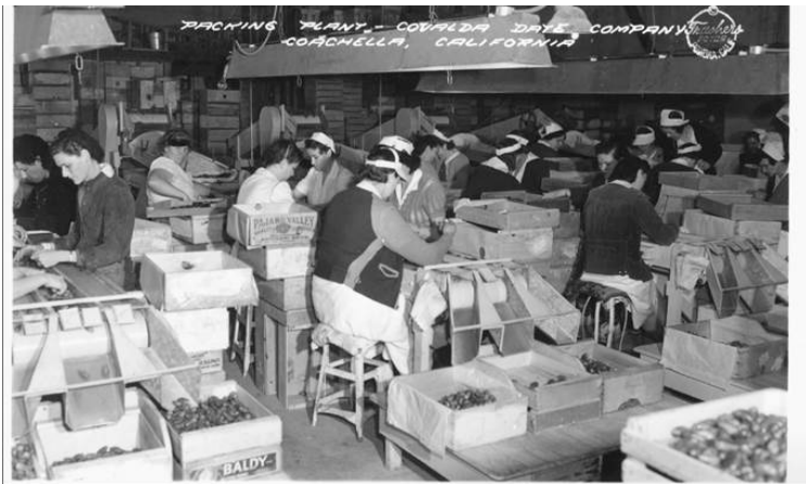
1941 Photo of Covalda Date processing workers