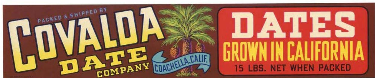
Marketing Label for the Covalda Date Company