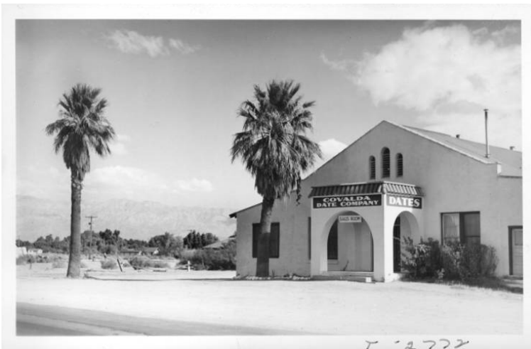
1940s Photo of the Covalda Date Company Building front elevation