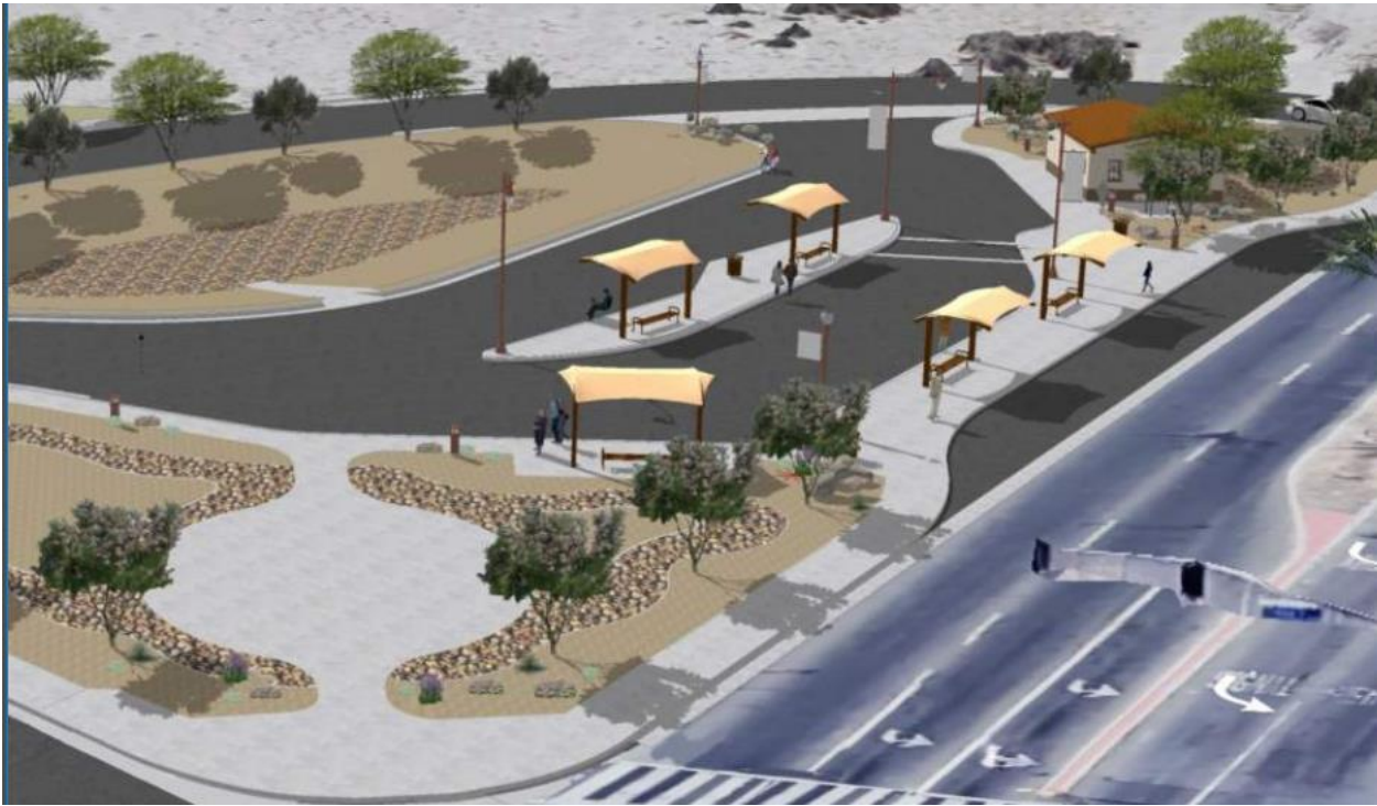
Figure 1: Rendering of the transit hub at a perspective view to the South