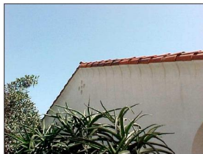
This creates an attractive shadow pattern