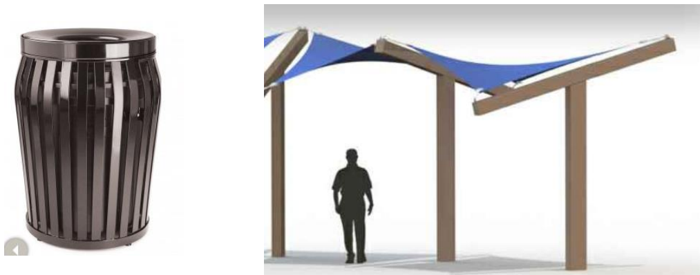
Figure 2: Example of Trash Container and Bus Hyper Shade Sail

The visible transit hub design features includes five (5) bus shelters consisting of two (2) hyper sail panels per bus shelter to provide shade for waiting bus riders. Hyper architecture is described as using infinite planar, linear elements, which form a smooth, continuous surface. The shade structure shown are yellow in color with brown colored (bronze powdercoat) metal supports. Two 96” long benches with a wood seat will be located beneath each bus shelter with a bronze powdercoat color. Three (3) litter receptacles are proposed with a bronze powder coat color. Decorative street lighting consistent with 6 th Street lighting standards is incorporated.