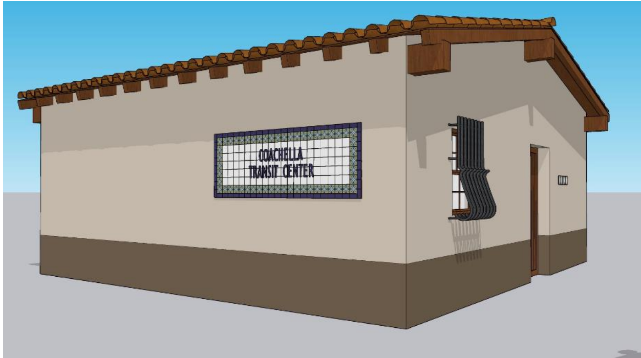
Figure 3: Rendering of the Sunline Breakroom Building

The proposed Sunline building is a pre-fabricated building. Staff expressed concern about the original building design with a pre-fabricated exterior look that is incompatible with the Pueblo Viejo design guidelines. Sunline designers developed modified exterior elevations with a red tile roof, stucco exterior, exposed rafters tail and beams, wood doors, window iron work and a tile sign more in the character of Spanish Colonial Revival architecture.