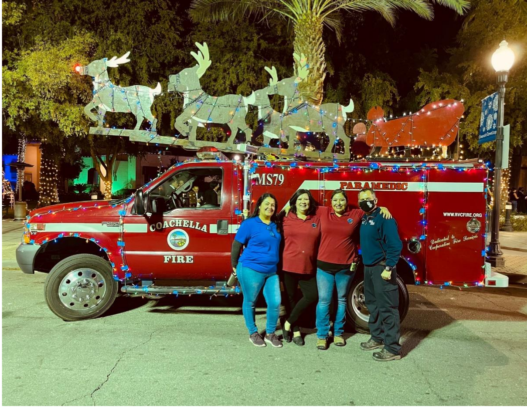
12/10/21 – City of Coachella Firefighters, Firefighter Reserves, and Explorer Post 679 participated in the City of Coachella’s Annual Holiday Parade. Our Fire Explorers enjoy making s’mores for parade attendees and appreciate the ongoing support from the City of Coachella. (See photos below)