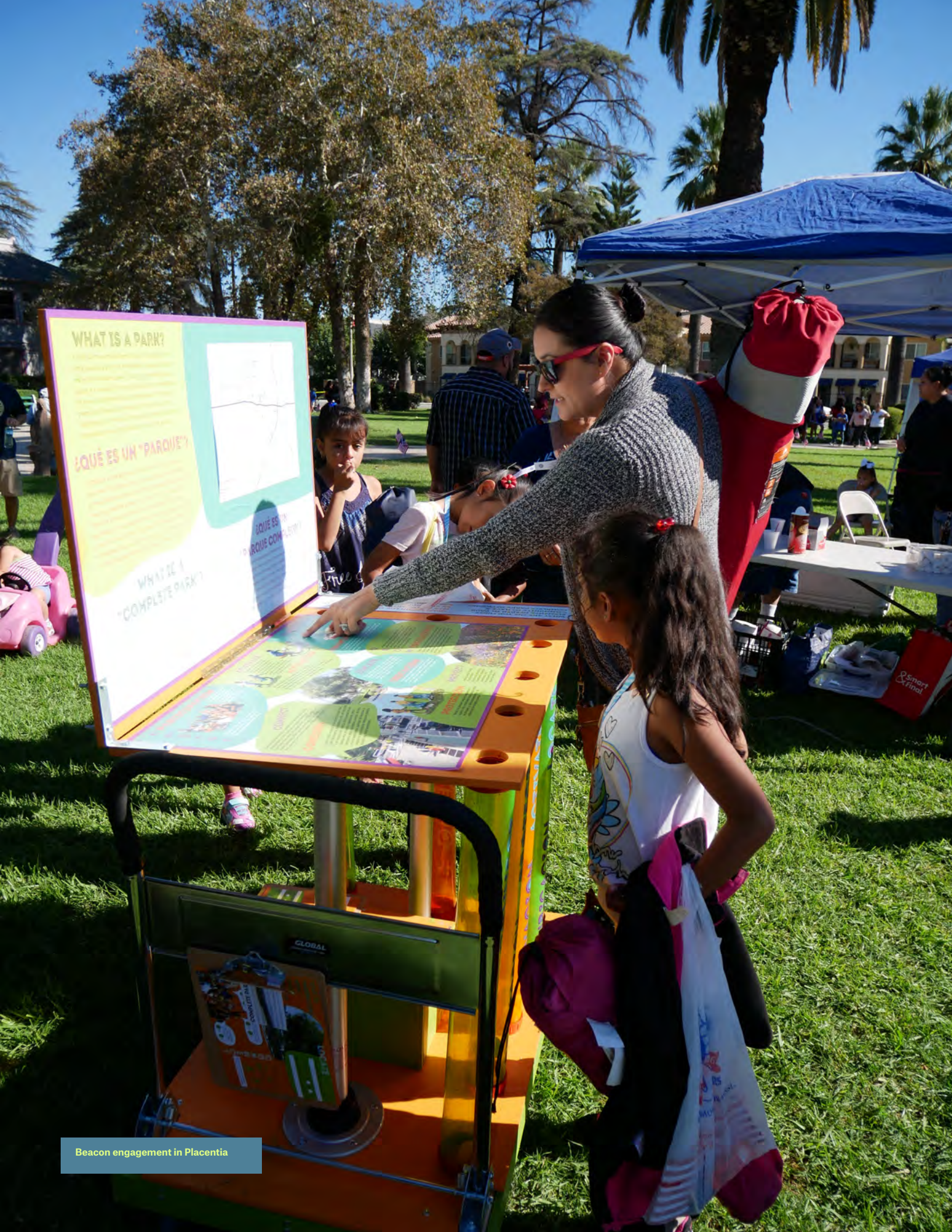
Beacon engagement in Placentia