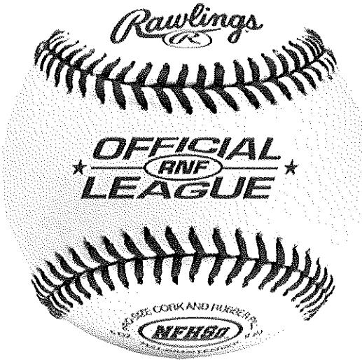
WHITE W/ RED STITCH