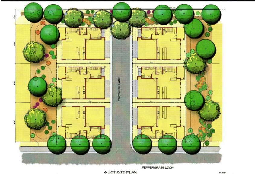
Figure 2: Residential Cluster Example

One floor plan and elevation is proposed. Each home contains 4 bedrooms and 3 baths as illustrated below and complies with the base district minimum dwelling unit size of 1,200 square feet. The two-car garage has an interior enclosure for trash bins, and the front entry porch has an area designated for the A/C mechanical equipment in order to keep the side yards clear of obstructions. Additionally, staff is recommending the use of “decorative” garage doors, with windows on the upper 25% of the garage door.