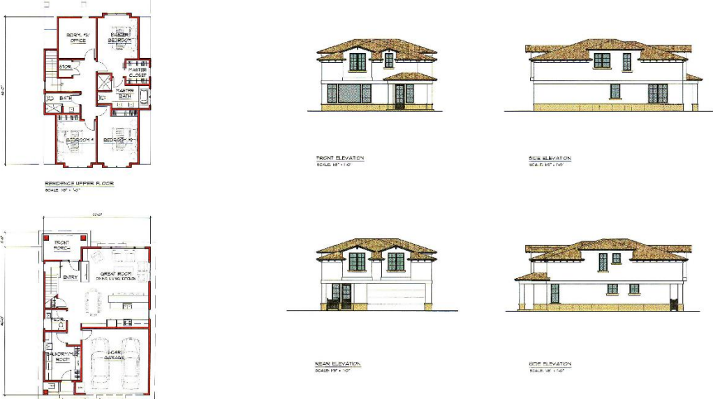
Figure 3: Sample Architecture

One floor plan and elevation is proposed. Each home contains 4 bedrooms and 3 baths as illustrated below and complies with the base district minimum dwelling unit size of 1,200 square feet. The two-car garage has an interior enclosure for trash bins, and the front entry porch has an area designated for the A/C mechanical equipment in order to keep the side yards clear of obstructions. Additionally, staff is recommending the use of “decorative” garage doors, with windows on the upper 25% of the garage door.