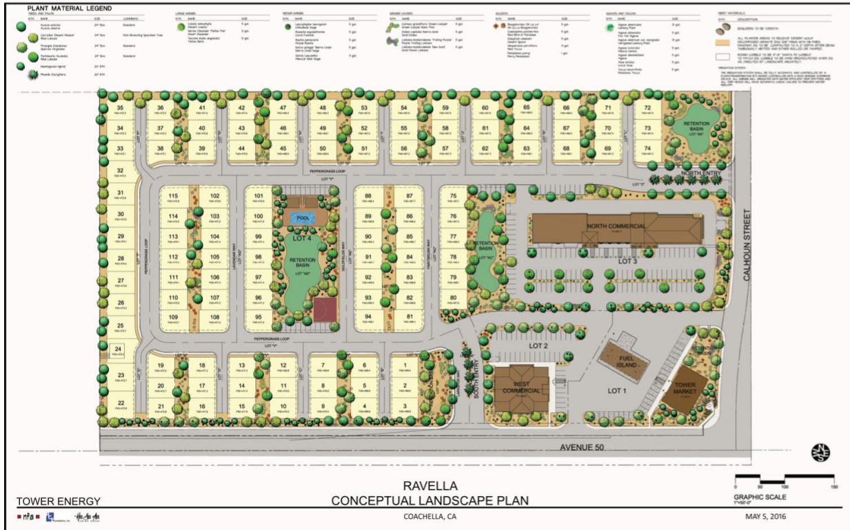
Figure 4: Landscape Plan

Staff recommends that the Planning Commission approve Resolution No. PC2024-22 for a third 12-month time extension for Tentative Tract Map No. 37088, subject to the findings and conditions of approval establishing a new expiration date of January 13, 2026.