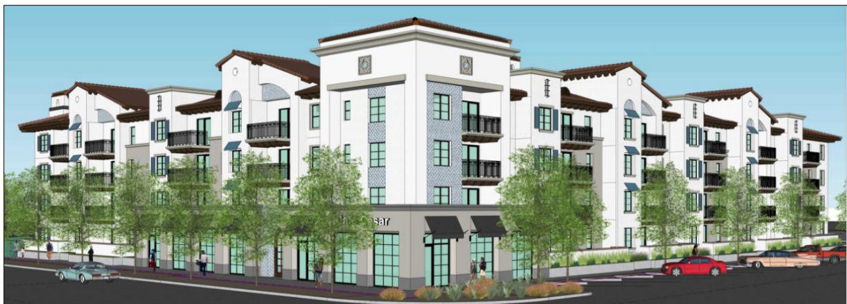
Figure 3: Rendering at the Corner of Cesar Chavez Street and Bagdad Avenue (Original Approval)

The overall architectural style of the approved project incorporates Spanish Colonial Revival design. The applicant proposes a redesign of the project to reduce costs due to conditions of approval for inclusion of elevators in both buildings and the original architectural design would be cost prohibitive. The applicant selected a new architect that designed the Pueblo Viejo Villas mixed use project and elected to include many of that development's architectural elements. The original design included a pronounced first floor retail area for Cesar Chavez Street and 6 th Street, significant articulation of building features, recessed windows, undulating roofline with several tower features. The applicant redesigned the project and presented new designs for a substantial conformance approval at the administrative level. The Development Services Director determined that the proposed site plan and architectural elevation changes were substantial and would require public hearing approval by the Planning Commission and City Council. The Director also provided comments to improve the design so that the redesigned project could be recommended for approval to the Commission and Council. The applicant worked on design revisions based on staff comments, which are presented in figures 4-7 below.