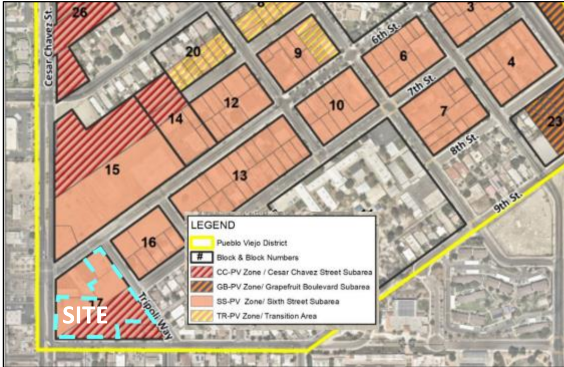
Figure 6: Zoning District and Design Guidelines Subareas