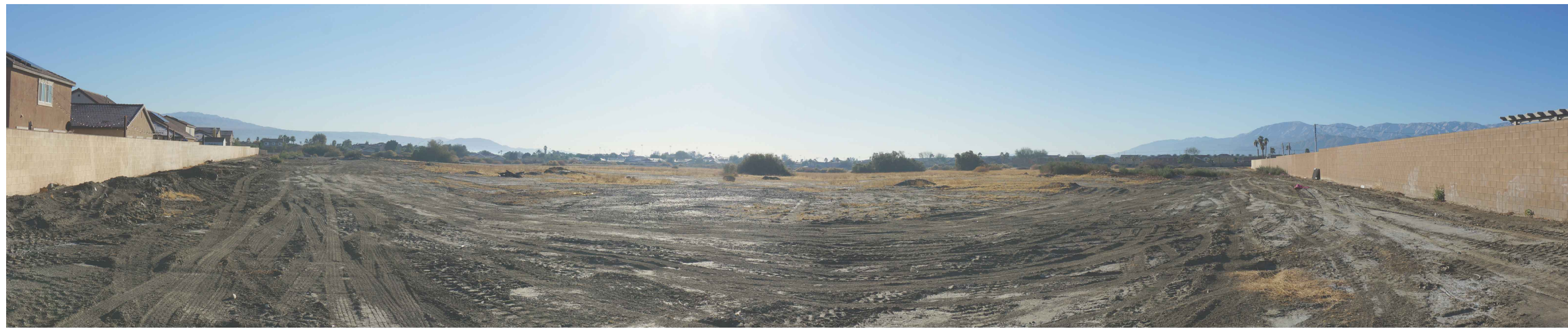
PHOTOGRAPH NO. 2