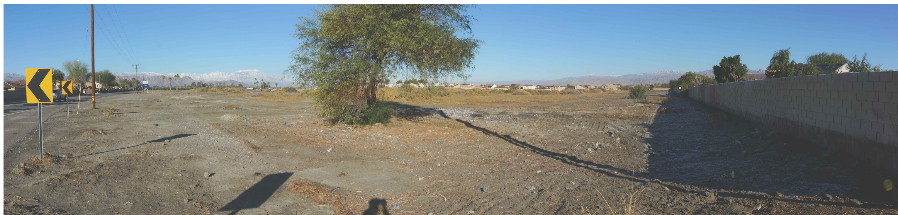
PHOTOGRAPH NO. 5