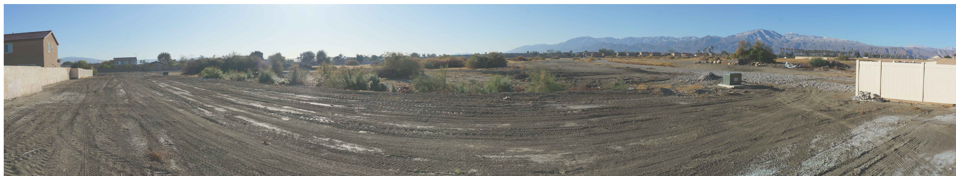
PHOTOGRAPH NO. 3