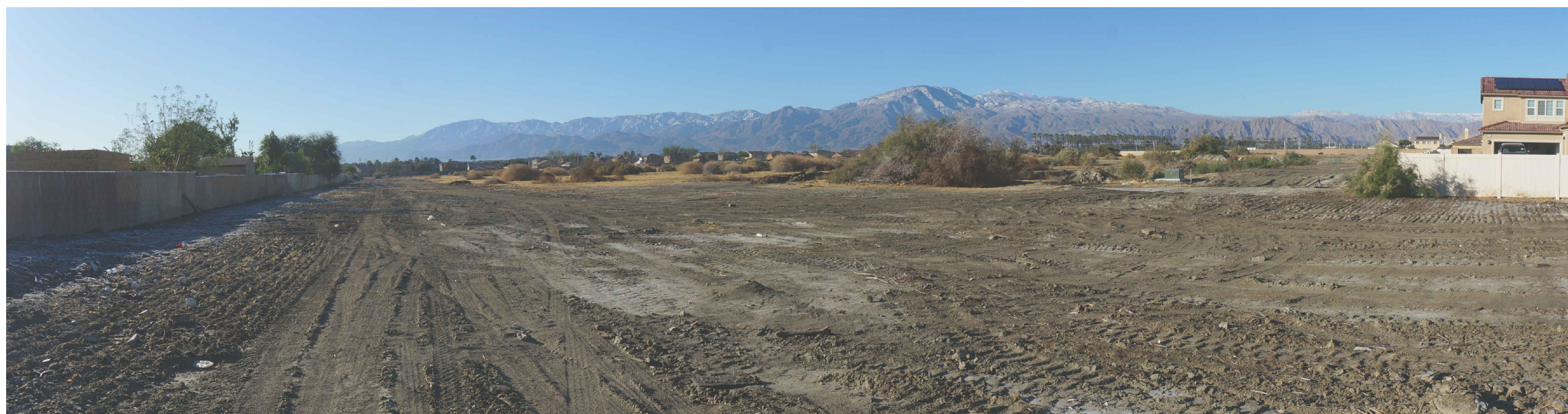
PHOTOGRAPH NO. 4