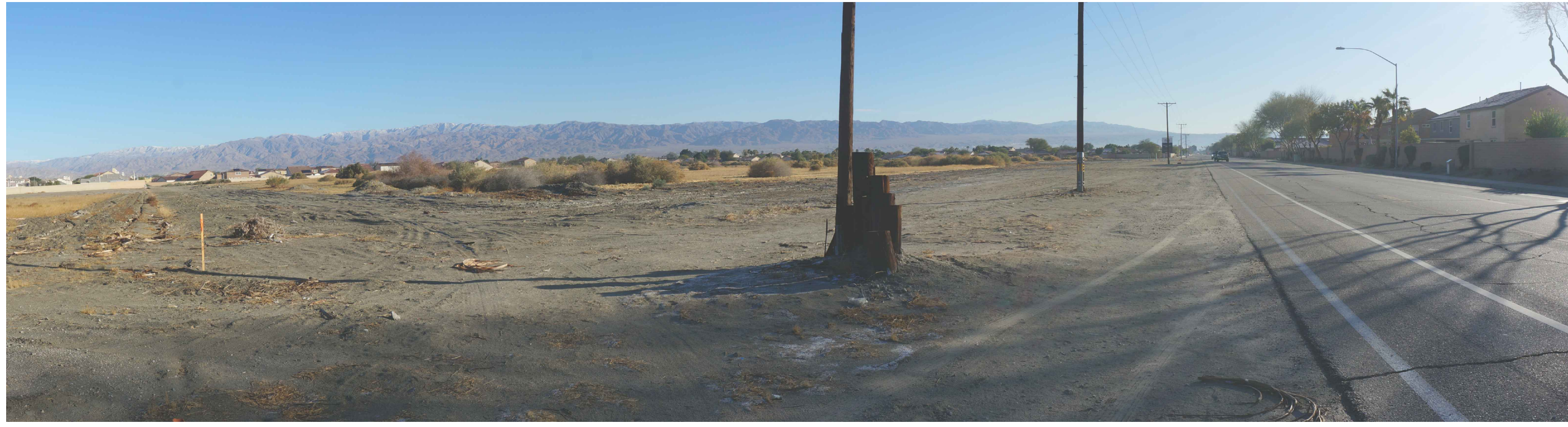
PHOTOGRAPH NO. 1