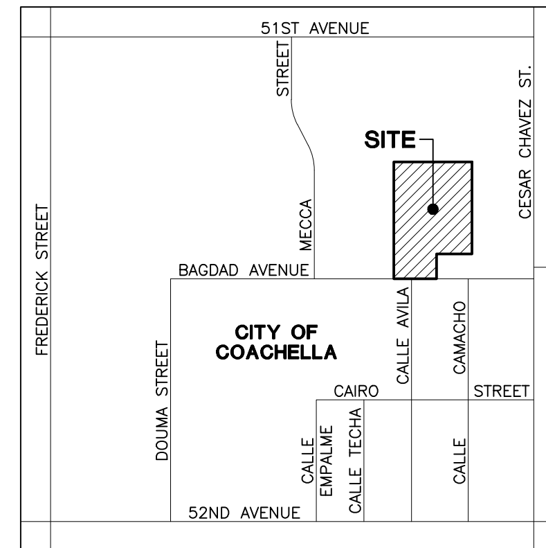
VICINITY MAP N.T.S.