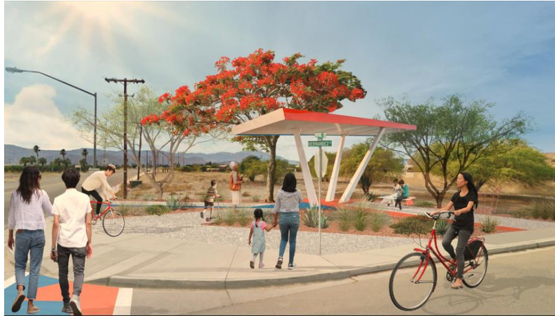
Figure 2 – East Perspective

The below exhibit depicts the proposed CV Link Connector plan that is proposed at the northwest corner of Avenue 52 and Sunset Drive. The proposed site area will have landscaping, decomposed granite, and variations of concrete. The site will also contain benches, a hydration station, a map kiosk, bike racks, trash and recycling contained, and a shade structure. The site area is proposing to utilize an orange and blue color palette and modern shade structure design that is consistent with the CV Link trail system throughout the Coachella Valley.