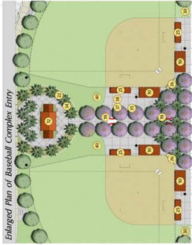
EXHIBIT 2 – RANCHO LAS FLORES PARK