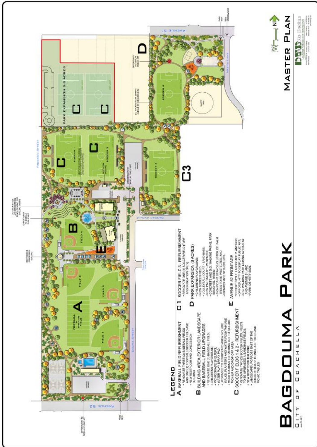
EXHIBIT 1 – BAGDOUMA PARK

MASTER PLAN BAGDOUMA PARK CITY OF COACHELLA DAVID J. DUNN LANDSCAPE ARCHITECTURE & PLANNING