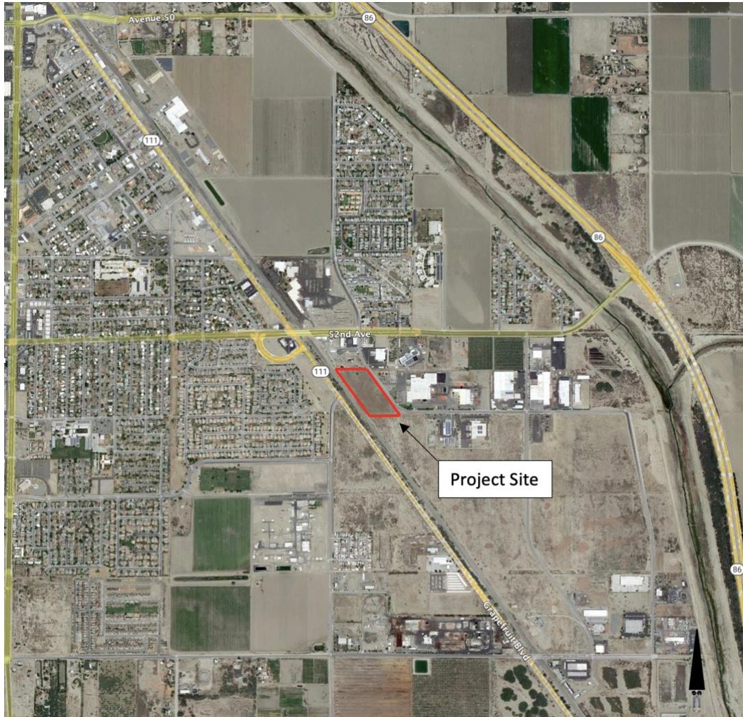
Figure 1 Project Site Location