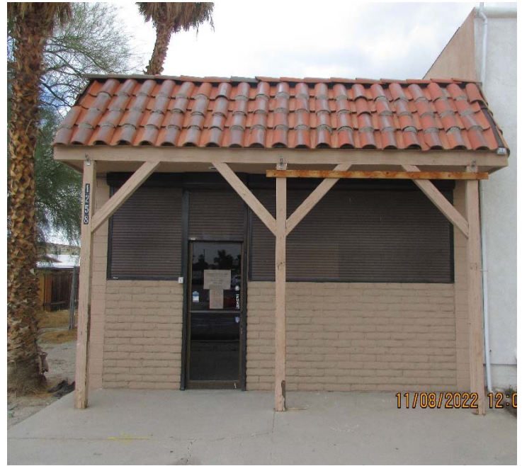
Coachella General location at 1258 6 th Street

The floor plan for the Coachella General lounge includes a coffee roastery counter as well as a separate counter for the beer and wine preparation area. The roaster/ tap room floor area will total 590 sq. ft. It will also include ADA accessible restrooms and on-site parking.