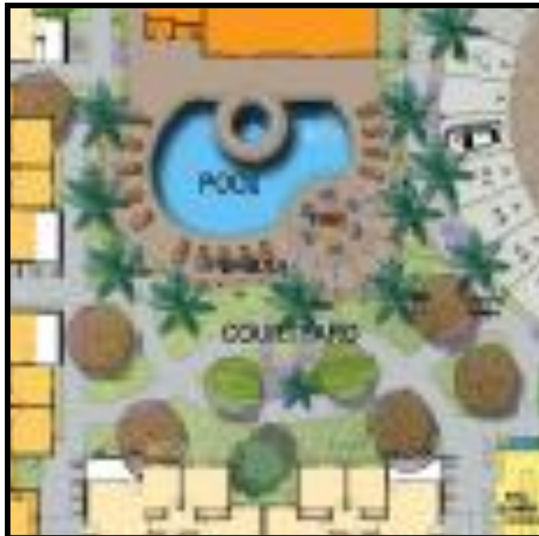
Figure 2: Proposed Main Community Pool Area

Pedestrian circulation will be developed to provide access throughout the site. Outdoor areas will be provided between buildings and interconnected by the proposed pedestrian circulation to provide readily available open space areas for residents to utilize. Additionally, a 5,000 square foot recreation building will be constructed west of the main entrance to the project site that will include additional amenities for residents on the project site. A pool and a spa will be developed next to the proposed recreation building and an additional pool will be developed in the southeast portion of the site. The exhibits below show the common open space areas, including two swimming pools, two garden courtyards between buildings, and the common-area retention basin with picnic amenities.