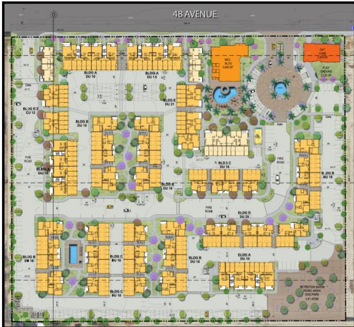
Figure 1: Site with Proposed Development

The Coachella Village Apartments project is proposed for development of a 9.69-acre site with a multi-family residential development consisting of 242 dwelling units and various recreational amenities. The Planning Commission first considered and recommended approval of the project to the City Council on November 15, 2017 the City Council. The project required City Council approval since the Architectural Review was also accompanied by a Change of Zone to modify the site zoning from General Commercial (C-G) zone to the Residential Multiple Family (R-M) zone. The project was considered and approved by the City Council on January 17, 2018. The Change of Zone was adopted by Ordinance and is in effect. The applicant submitted engineering and building plans, which have been approved. Engineering and Building permits cannot be issued due to the Architectural Review No. 17-12 expiration on January 17, 2019 (expiration occurs 12 months from the approval date of January 17, 2018) and requires new approvals by the City. Architectural Review No. 22-12 and Variance No. 22-04 were submitted by the applicant for the same project with no proposed modifications. Staff does not proposed any new modifications to the project or the conditions of approval and recommends the Planning Commission approve the original project design.