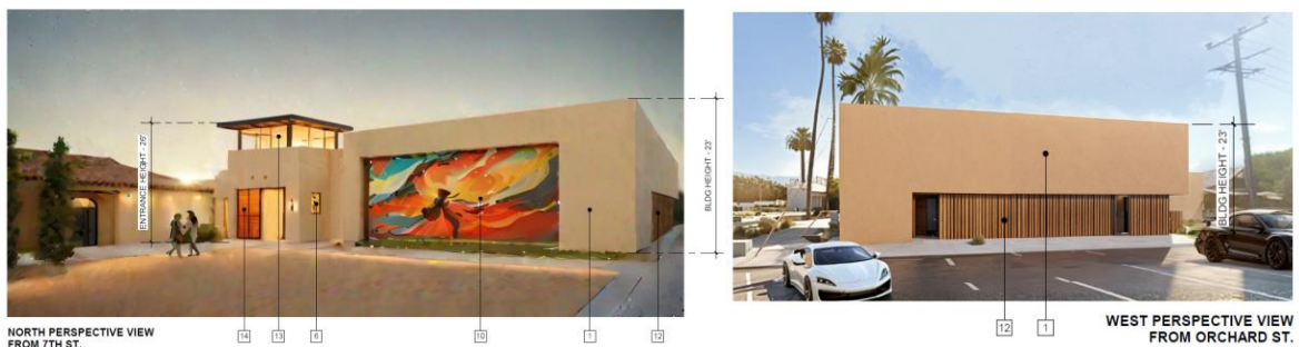
Figure 4 – North and West Perspective