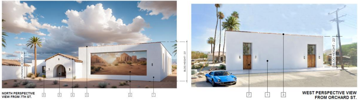
Figure 2– North and West Perspective