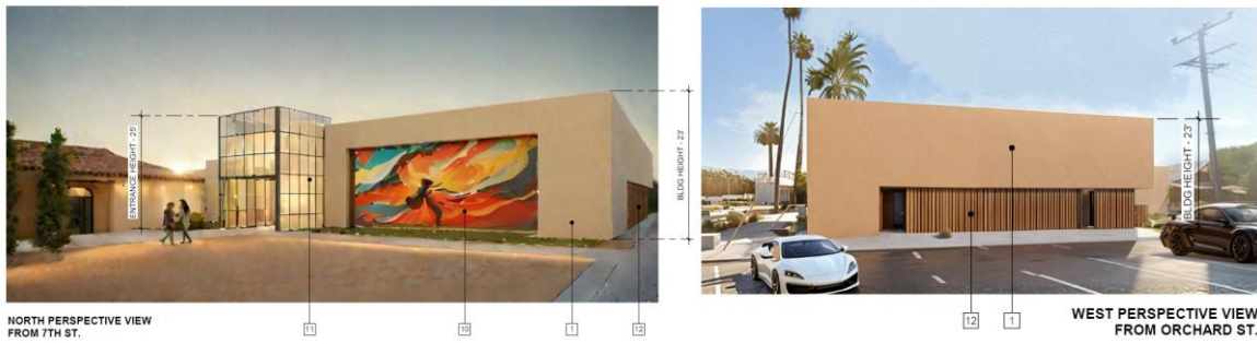
Figure 3 – North and West Perspective