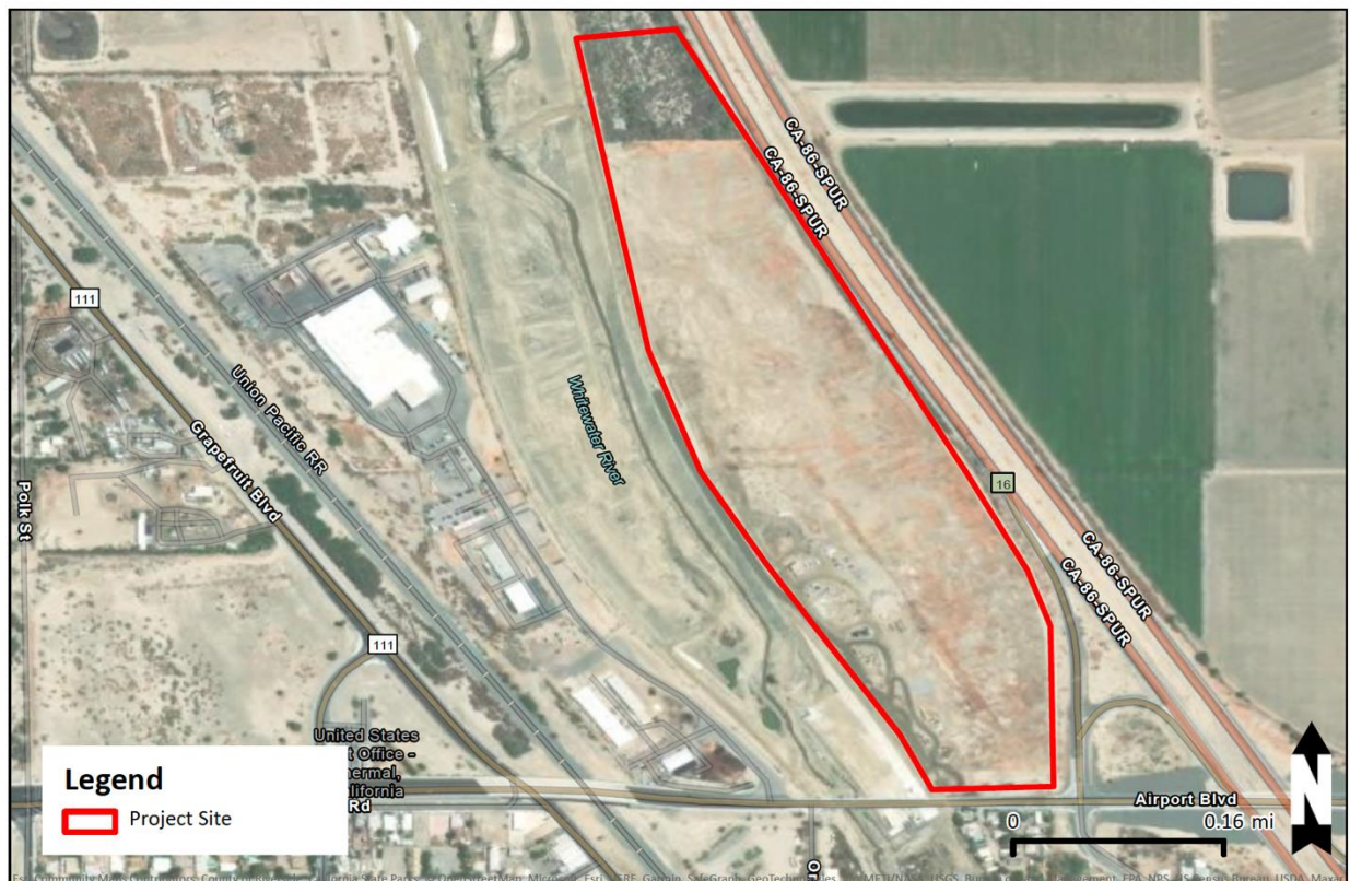
Figure 1 - Vicinity Map