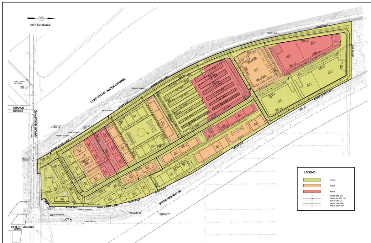
Figure 3 – Phasing Plan

AR 20-04 addresses the entire Project site, and provides a master plan for site design, architecture and landscaping within the Project. Although no specific users for the site are known at this time, the AR will assure cohesive and high quality development within the Project. As described above, and in Attachment 2 and below, the Project is proposed to develop in phases, and may take, depending on market forces, as long as 20 years to develop. As such, a master plan for the architecture and landscaping is critical to provide direction, but the AR may require amendment when specific users are identified, or changes in building footprints are identified to meet user needs. Any such changes would require amendment of the AR, which would be reviewed consistent with City requirements for such changes. As proposed, the Phasing Plan would assure that all Project components will be built in a unified manner, including the internal roadway system and perimeter landscaping, which are proposed in Phase 1. Development plans for the site will be provided as the applicant identifies buildings and areas for development, and will be processed through the Public Works and Building Departments, with the Planning Department assuring compliance with the approved AR.