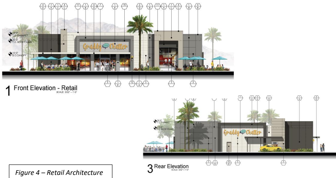
Figure 4 – Retail Architecture

The arrangement of buildings within the Project is grouped by business type, with smaller building masses located closer to Airport Boulevard, and the largest building masses at the northern end of the site, in an area that will be less visible from City streets. Building architecture has been detailed for each area of the Project, and is provided on pages A-201 through A-206 of Attachment 3. Details are shown below.