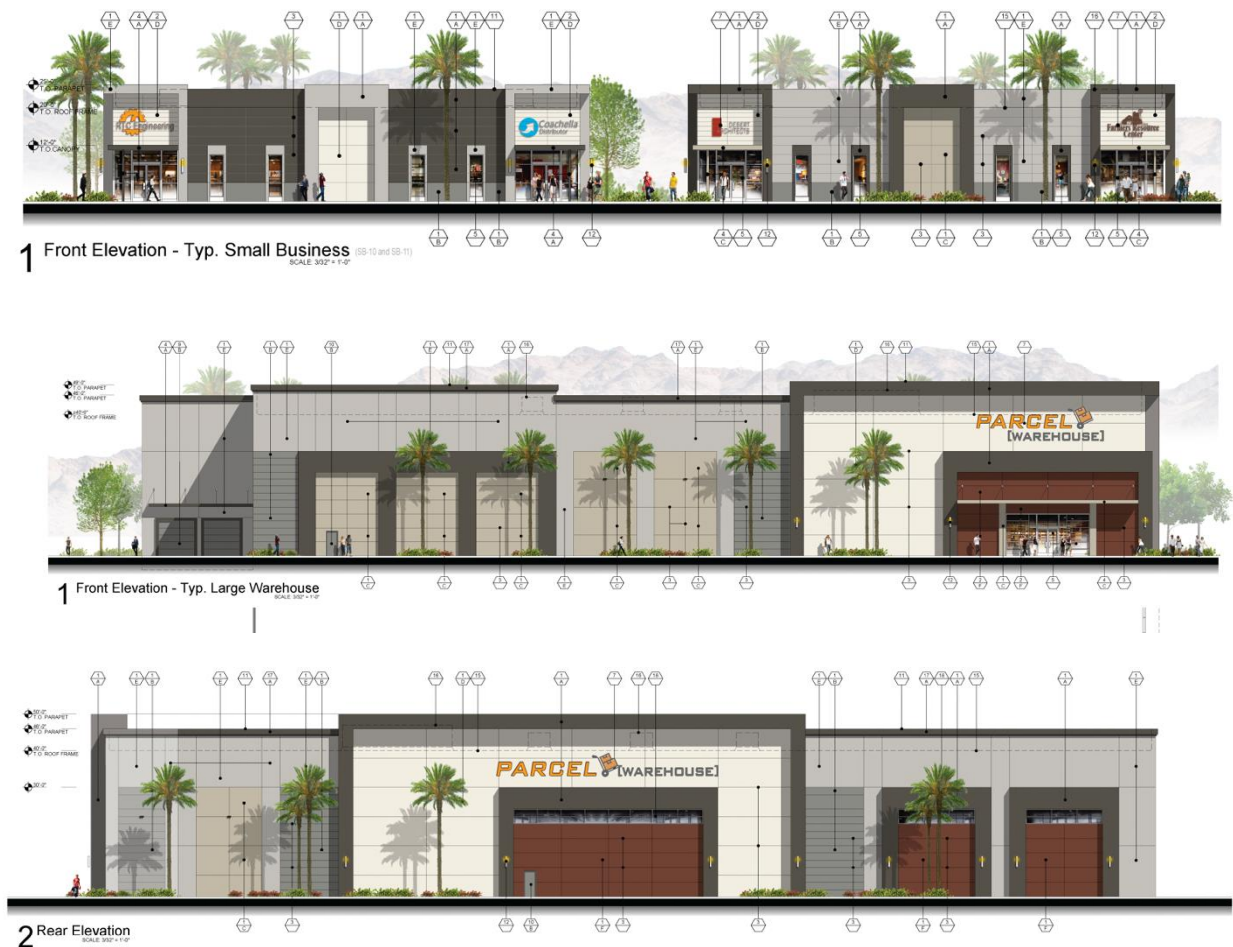
Figure 5 – Small Business and Large Warehouse Architecture

Building heights for the CG zone range between 24 and 28 feet, and for buildings within the MS zone, range from 24 to 50 feet, depending on the development area. Only the large warehouses are proposed to extend to 50 feet. These building heights are consistent with each zone’s development standards.