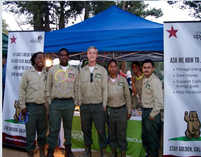
Urban Youth Conservation Corps