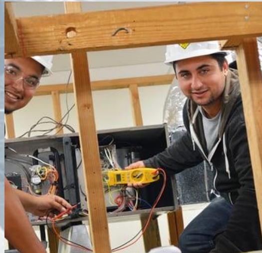
Electricians + HVAC Technicians