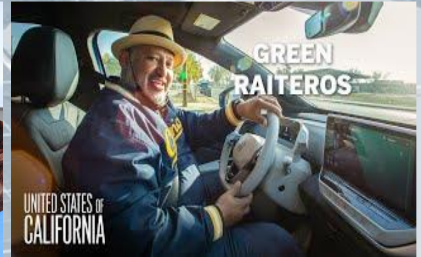
Zero Emission Vehicle Rideshare Drivers