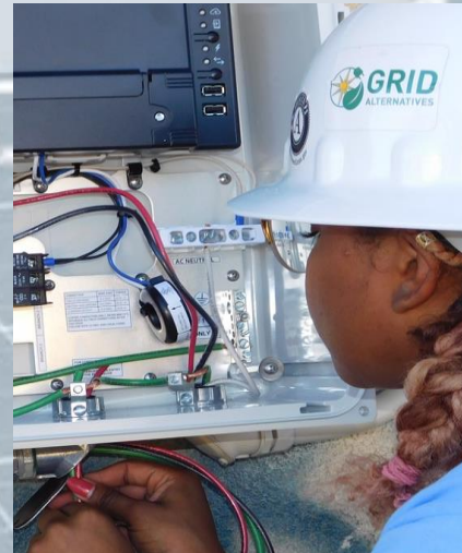
Solar Photovoltaic Installers