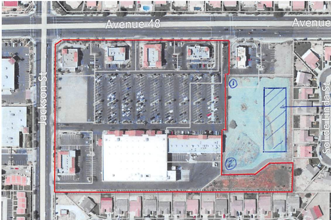
Subject Aerial Photo. Outlined areas subject units.