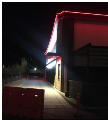
Figure 4: In-N-Out Comparison