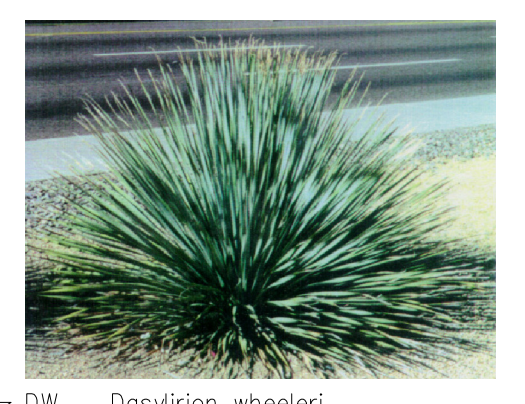
DW Dasylirion wheeleri Desert Spoon (Grey)