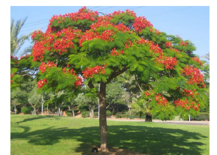
Delonix regia Royal Poinciana