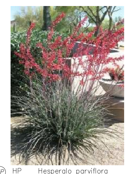
HP Hesperalo parviflora Break Light