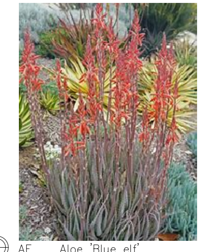
AE Aloe 'Blue Elf' Blue Elf