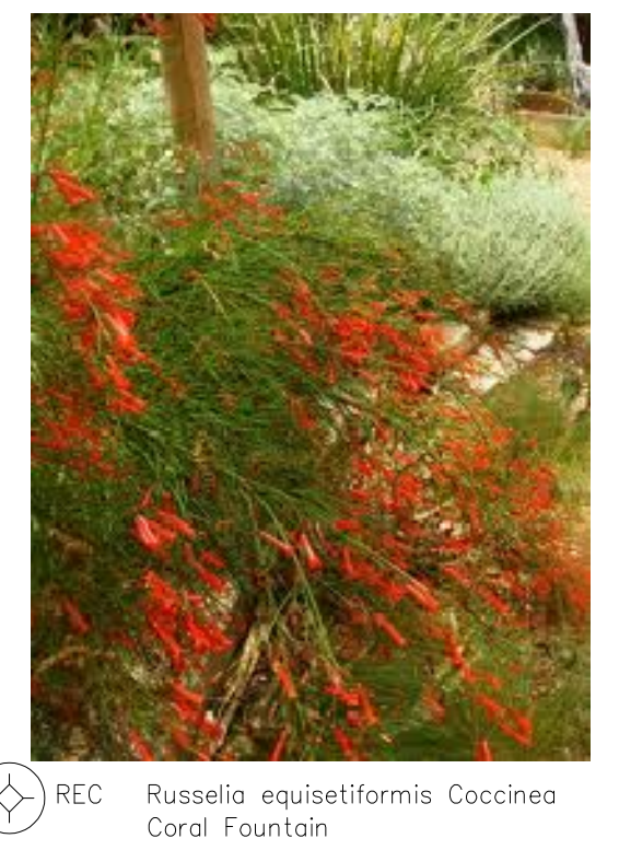
REC Russelia equisetiformis Coccinea Coral Fountain