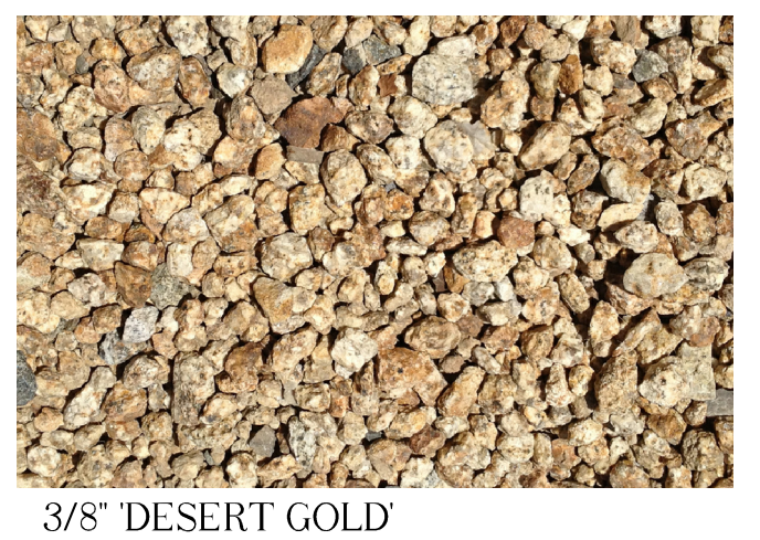
3/8" DESERT GOLD