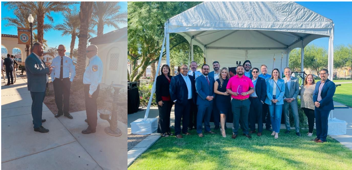
11/5/22 – Coachella City Firefighters and Explorer Post 679 joined in the Run with Los Muertos event held on 6 th Street. (See photos below)