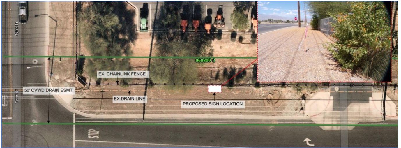
Figure 2: Proposed Sign Relocation at Subject Site.