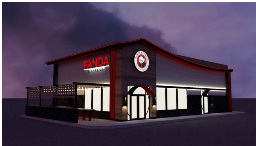
Figure 2: Proposed LED Lighting strip evening perspective

The proposed LED lighting strips would be directly applied to the “swinging” roof shape element and would be red in color (Figure 2). Staff requests Planning Commission review of this modification as it was not originally considered by the Planning Commission and could be classified as signage rather than an architectural feature. Staff recommends that appropriate application of the LED lighting strip would be to obscure the lighting so that it is tucked under the “swinging” element and emits a halo lighting effect that is more understated and visually appealing