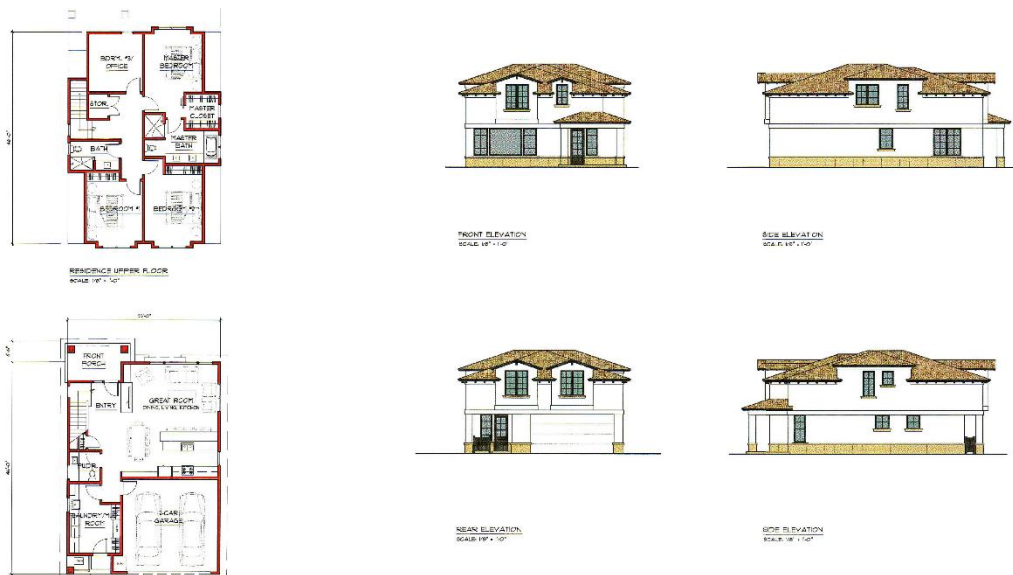
Figure 3: Sample Architecture

One floor plan and elevation is proposed. Each home contains 4 bedrooms and 3 baths as illustrated below and complies with the base district minimum dwelling unit size of 1,200 square feet. The two-car garage has an interior enclosure for trash bins, and the front entry porch has an area designated for the A/C mechanical equipment in order to keep the side yards clear of obstructions. Additionally, staff is recommending the use of “decorative” garage doors, with windows on the upper 25% of the garage door.