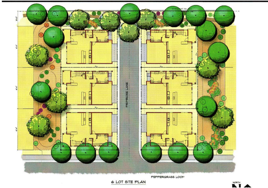
Figure 2: Residential Cluster Example

One floor plan and elevation is proposed. Each home contains 4 bedrooms and 3 baths as illustrated below and complies with the base district minimum dwelling unit size of 1,200 square feet. The two-car garage has an interior enclosure for trash bins, and the front entry porch has an area designated for the A/C mechanical equipment in order to keep the side yards clear of obstructions. Additionally, staff is recommending the use of “decorative” garage doors, with windows on the upper 25% of the garage door.