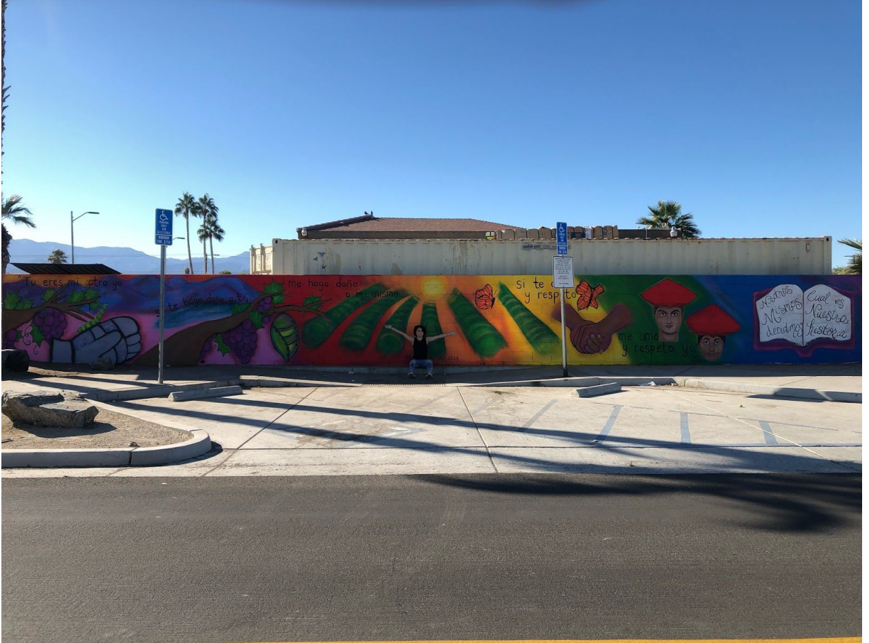
Completed Mural in Mecca, CA