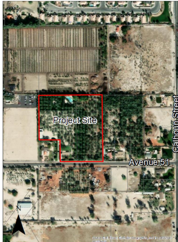
Figure 2 - Vicinity Map