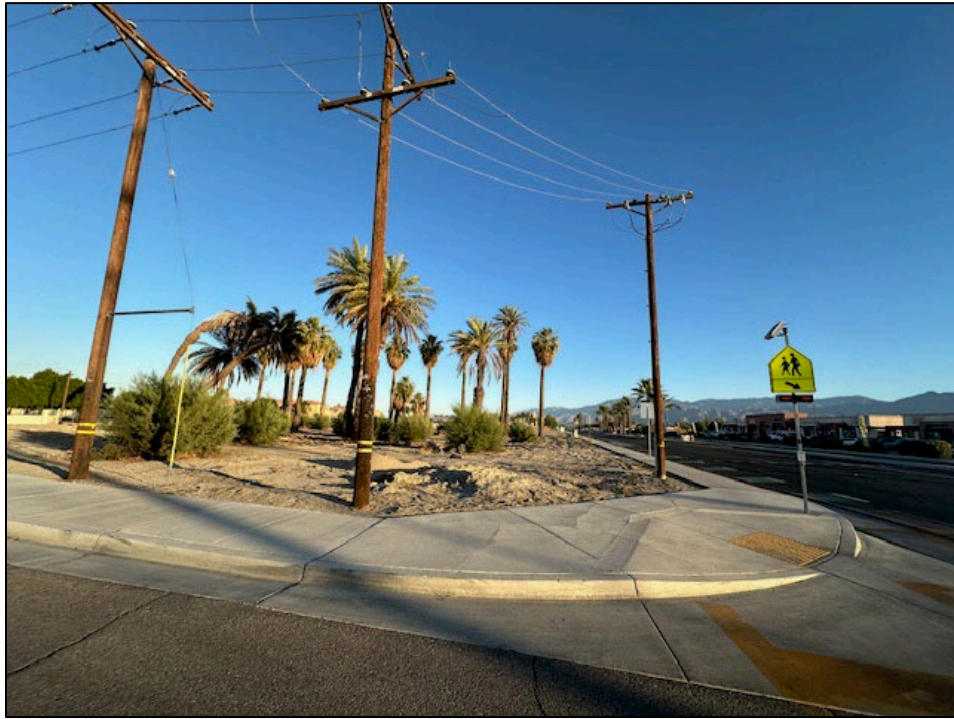
Vacant site to the South (Across Valley Road)