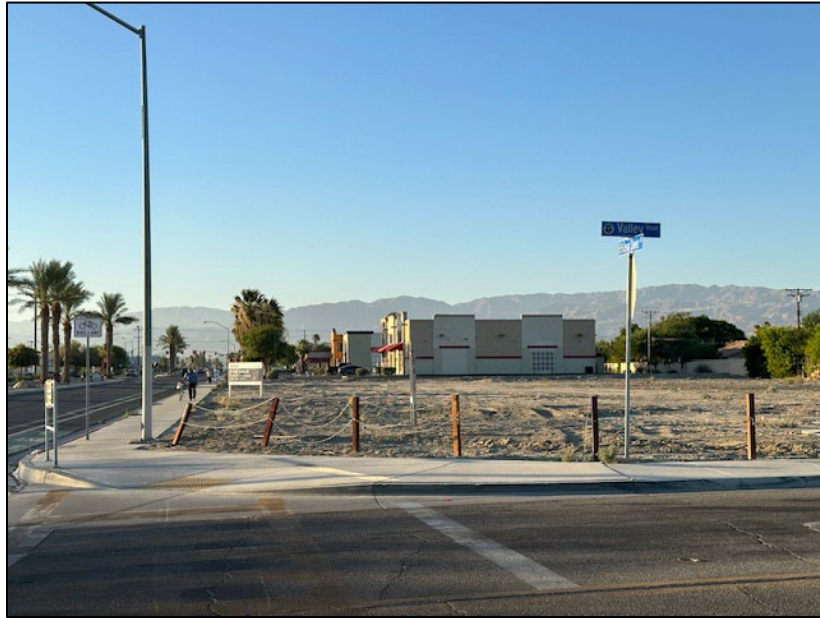
Project site at Southwest corner