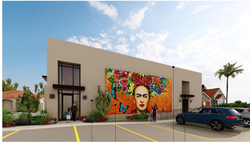
Figure 2 – North Perspective