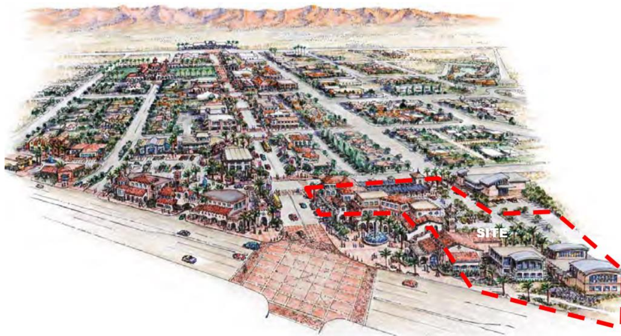
Figure 1: Pueblo Viejo Revitalization Plan Perspective Sketch

On April 20, the Planning Commission held a public hearing for the Tripoli Mixed-Use Project and recommended that the City Council approve the project with a modification to condition of approval 9 of Resolution No. PC 2022-10 to require an elevator in Building A, despite applicant concerns that the addition of the elevator for Building A would be a hardship for project.