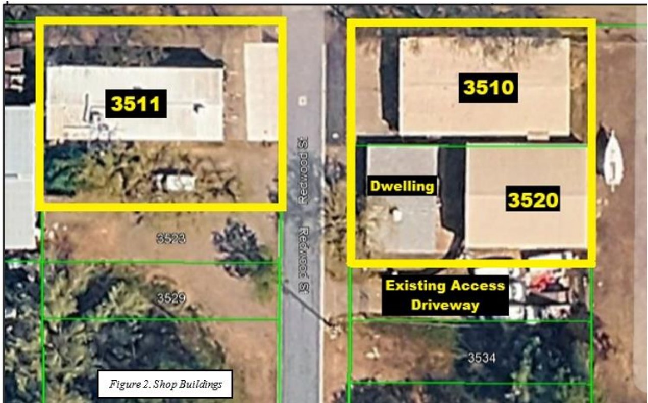
Figure 2. Shop Buildings