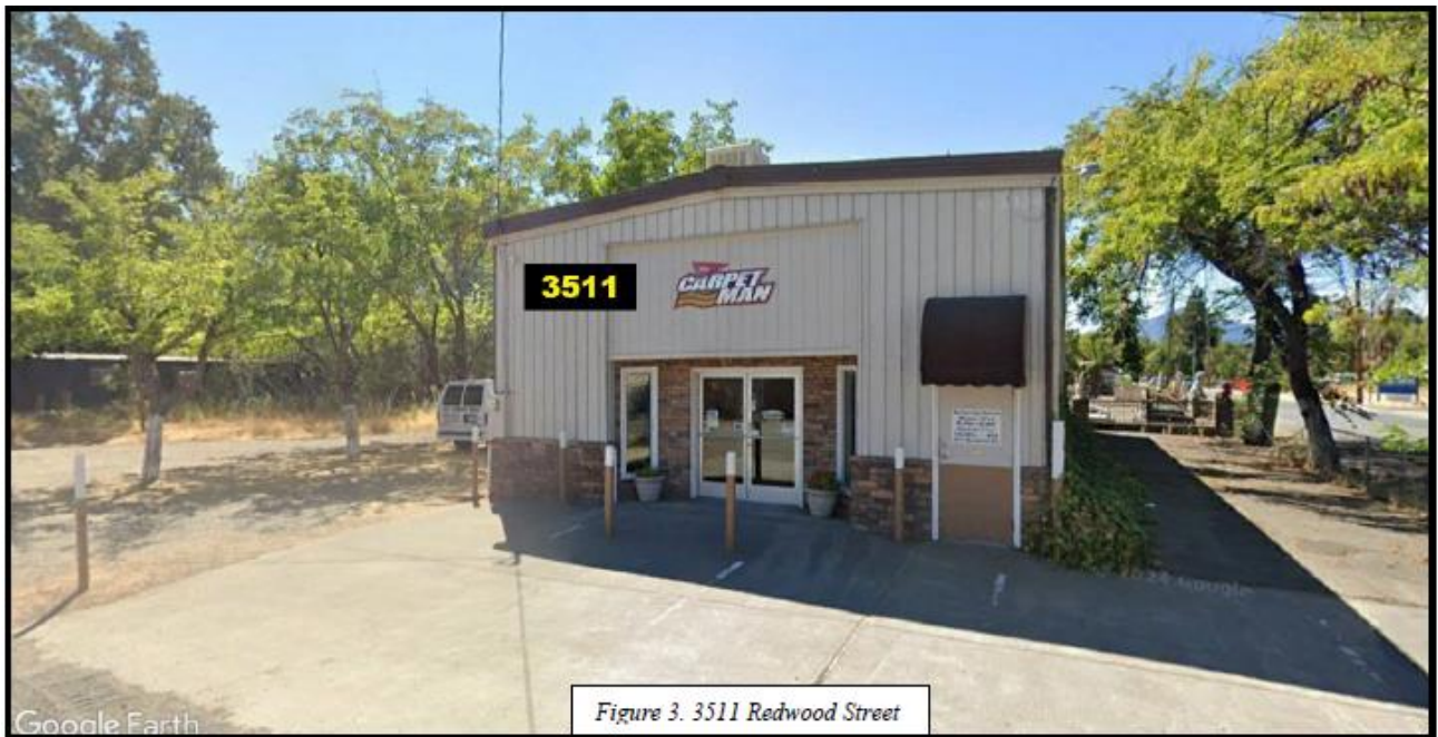
Figure 3. 3511 Redwood Street