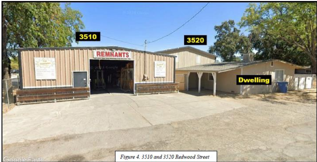
Figure 4. 3510 and 3520 Redwood Street