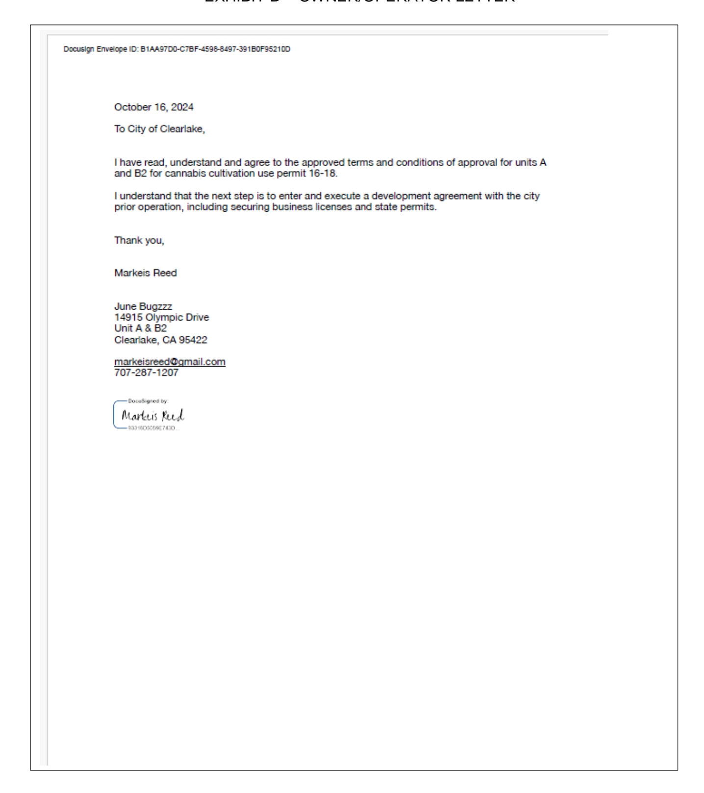
EXHIBIT D - OWNER/OPERATOR LETTER