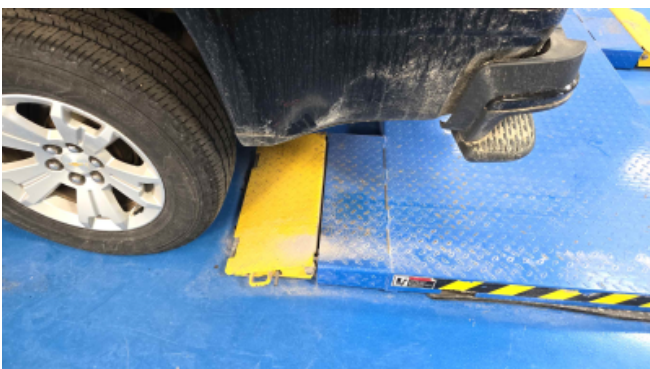
4/9/2024 E01 Comments: