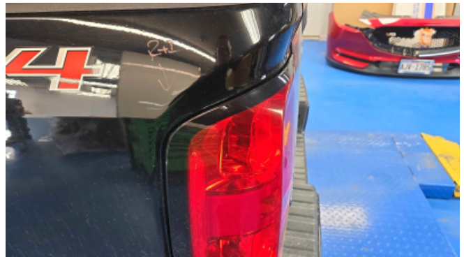
4/9/2024 E01 Comments: