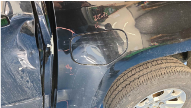
4/9/2024 E01 Comments: