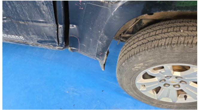
4/9/2024 E01 Comments: