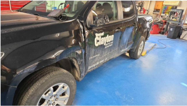
4/9/2024 E01 Comments: