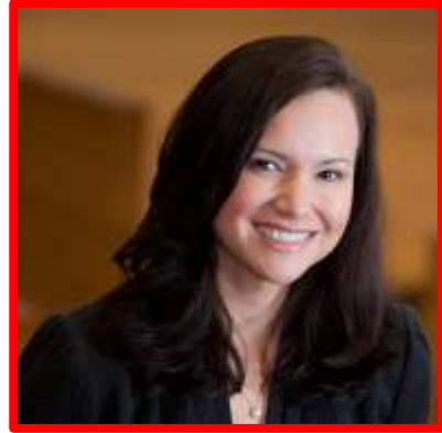
Ashley Moody (R)