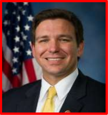
Ron DeSantis (R)